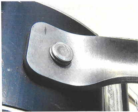
Good – Swaged (flattened) Screw

When inspecting 20ft. Dyna-Lock handle screws, compare them with the photos below. These photos illustrate the ends of a swaged (flattened) screw and an unswaged screw. Note that the swaged screw appears flattened; whereas, the unswaged screw has a cup shape appearance with a raised edge: