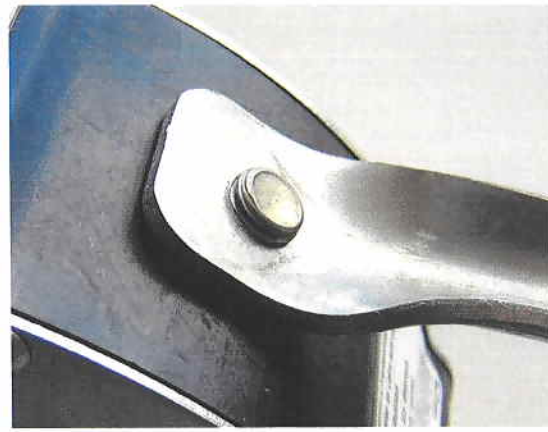
Bad – Unswaged (cup shaped) Screw

Upon inspection, if any units are found to have unswaged screws (one or both), immediately remove the unit from service. Complete the attached shipping form and return the unit and the shipping form to MSA at the address provided below: