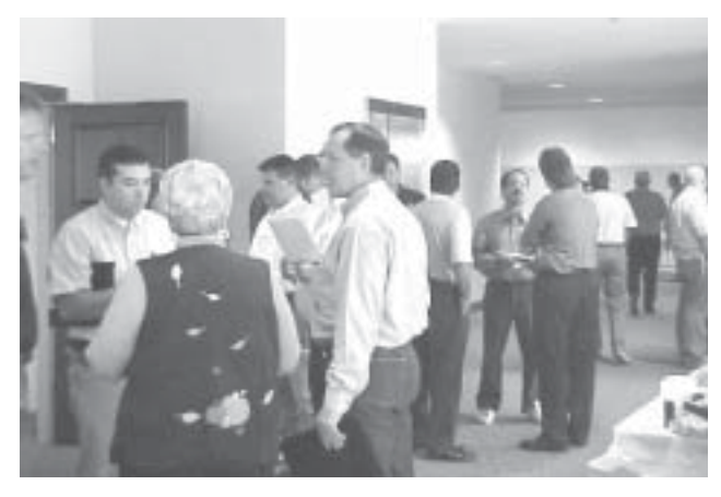
One of the benefits of the meeting was networking.

Texas Industries (TXI) is a longtime believer in the necessity of a good working relationship between industry and MSHA. One very effective means of demonstrating the two-way emphasis of this partnership is the Stakeholders Meeting.