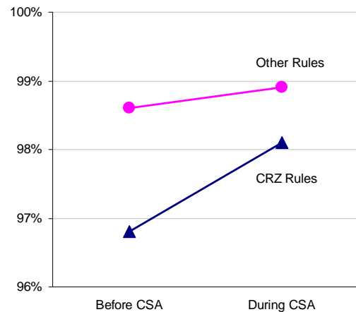
Figure 2. Average percent passes of FTX tests before and during CAB at the SASU.