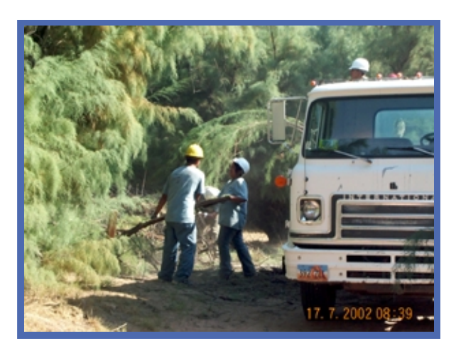
Students loading cut tamarisk into truck for removal.