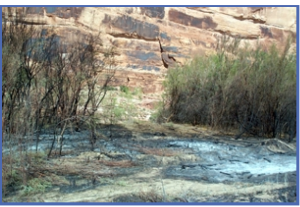
Fire break at Goose Island campground that was instrumental in stopping the fire spread into the campground.

In early May this year, fuels reduction work saved a popular BLM campground from major damage. An early season wildfire, pushed by wind, rapidly spread up the river bottom and threatened to overrun the Goose Island campground, near Moab. The campground was quickly evacuated and fire crews, using the fire break that had been created just two weeks previously, were able to stop the fire before it seriously damaged the campground facilities.