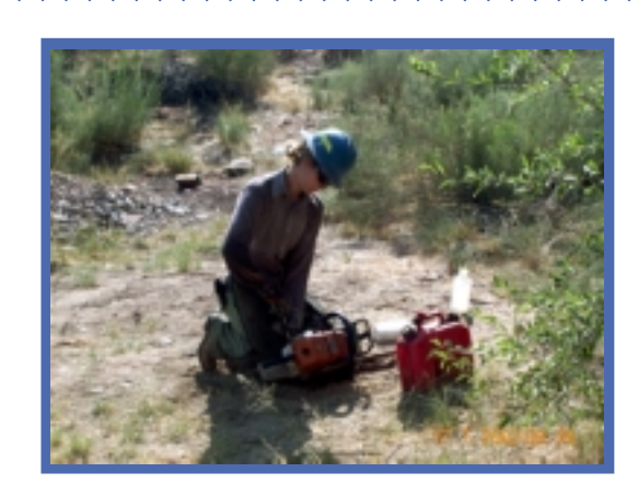
"4 Corners School" student cleaning her chainsaw.