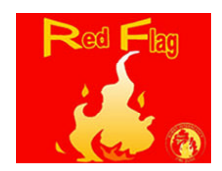
Red Flags emblazoned with this graphic will be given to volunteers to display during a Red Flag Alert.

Local Red Flag Program volunteers will be given a 3