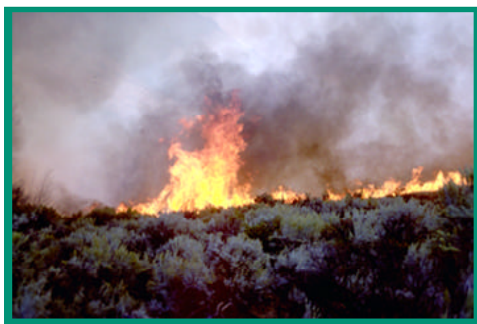
Stimulating community involvement in the Burns Interagency Fire Zone program might help prevent wildfires like the human caused incident in the Pueblo Mountains shown above.

Through local newspaper and radio news shows, Red Flag coordinators in Burns are promoting the citizen volunteer program. A brochure with program information and coordinators will be available this summer. Looking ahead, volunteers will be trained to identify severe weather conditions common to Harney County and to assist in reporting wildland fires. Red Flag efforts are supported through the zone prevention program and are intended to reflect objectives identified in the National Fire Plan.