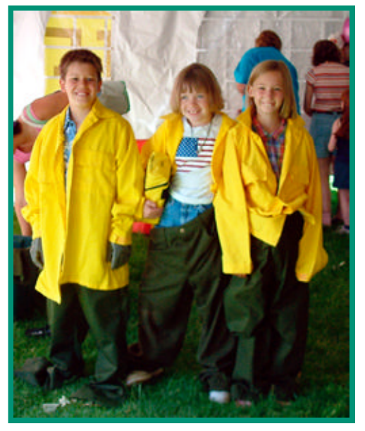
Youngsters got to try on firefighter nomex clothes, even though some appeared a bit dubious at the experience!