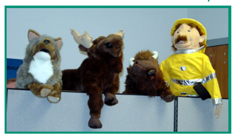
Fire prevention puppets in action.

children match safety, good fire-bad fire, and "stop, drop and roll."