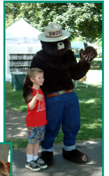
Smokey was a big attraction at the NIFC tent!

The southeastern Oregon neighboring communities of Burns and Hines are no strangers to the dangers of wildland fires. In 1990, the 74,000 acre Pine Springs Basin Fire threatened both communities. As a result of that fire, the Burns Interagency Fire Zone was formed. The four agencies within the zone are the USDA Forest Service, BLM, US Fish and Wildlife Service, and Oregon Department Forestry. They work together to prevent and suppress wildfires in the broad high desert expanse of southeastern Oregon.