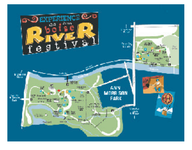
The festival was heavily promoted by media and local business, which helped to ensure a large turnout over three days.

One of the key attractions at the festival this year was the tent display and activities hosted by the National Interagency Fire Center (NIFC), which is located in Boise. Staff from the fire center, Lower Snake River District, Idaho State Office, and the Boise National Forest provided learning opportunities for children and parents through the use of model Firewise homes. A "hands on" interaction was used to allow people to make changes to model homes in the wildland urban interface and make them more resistant to