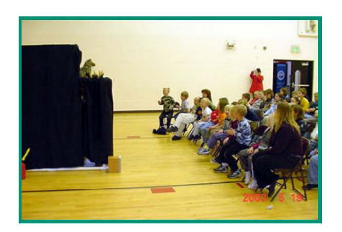
Puppet show presented at a local school. Kids loved it!

The first step in establishing the puppet show was to order the puppets. The original concept to use puppets looking like people, but was soon changed to one with animal puppets. The animals helped to reinforce the wildland message and were less expensive. Christiansen and her staff also ordered a music CD which includes songs that teach