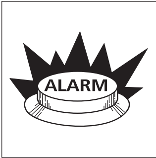
Safety and Security