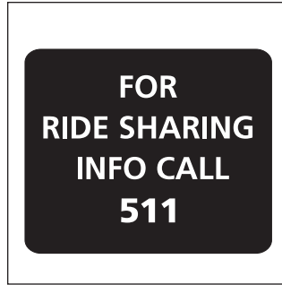
Transit Demand Management