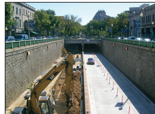
Partial Road Closure in Washington, DC

The matched peer will then contact the agency to work out the details of the assistance to be provided within the program framework. In some instances, this may include a site visit by the peer.