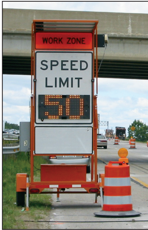
Work Zone Variable Speed Limit System

For information on how to get the Work Zone Safety and Mobility Peer-to-Peer Program working for you, or to become a peer, please email: