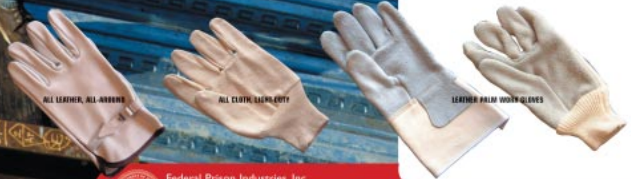
ALL LEATHER, ALL-AROUND

UNICOR products are now available on GSAAdvantage! ® www.gsaAdvantage.gov