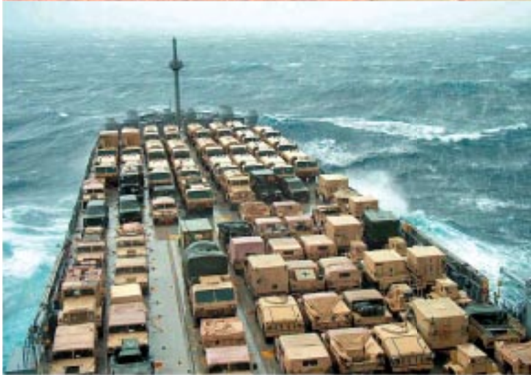
MILITARY VEHICLES SHIPPED OCEAN FREIGHT RECOMMENDED TO BE TREATED WITH CARWELL INHIBITOR