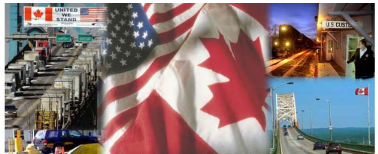
BIFA is a bi-national effort led by FHWA and Transport Canada with sponsorship from the U.S. DOT ITS Joint Program Office and support from the National ITS Architecture Team.

The Transportation Border Working Group, a bi-national group that works to enhance coordination and planning between the United States and Canada, identified collaboration on the implementation of border technology as one of its key priorities. To advance this priority, the U.S. Department of Transportation (USDOT), Federal Highway Administration (FHWA) and Transport Canada, in partnership with state and provincial transportation organizations, regional planning organizations, and other federal agencies, initiated the development of a Border Information Flow Architecture (BIFA). The process to develop regional BIFA was similar to the one used to develop regional intelligent transportation systems (ITS) architectures, described in Regional ITS Architecture Guidance—Developing, Using, and Maintaining an ITS Architecture for Your Region ( http://www.itsdocs.fhwa.dot.gov/JPODOCS/REPTS_TE//13598.pdf ).