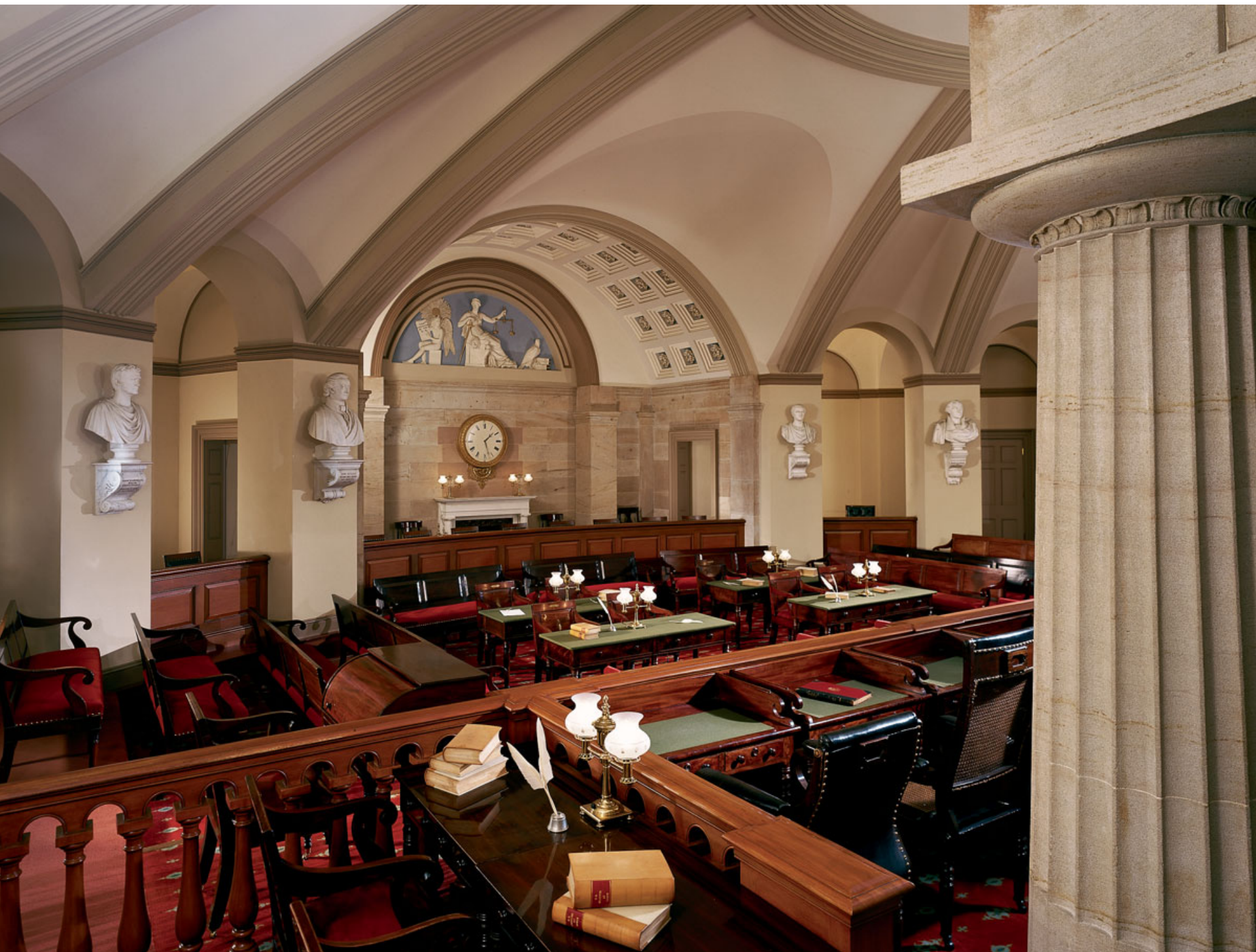
Marble busts of the first four chief justices are displayed in the Old Supreme Court Chamber. Left to right: John Marshall, John Rutledge, John Jay, and Oliver Ellsworth. (2000 photograph)