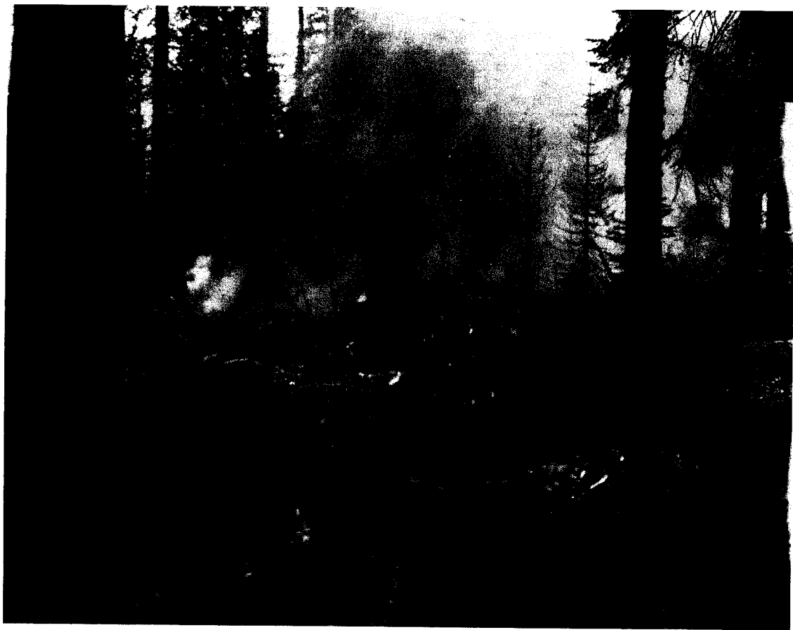
FIG. 2. Amador county, 1899. Near sawmill 5–6 km (3–4 miles) below dam on Bear River. Forest fire in fir and pine, killed all seedlings, just started.

The largest trees in the red fir stands were Abies magnifica and Pinus jeffreyi with DBH's of 160 cm (63 inches). Abies magnifica was the most common tree in the stands accounting for 63 percent of all trees inventoried and 68 percent of average stand basal area (Table 5). The next most common tree found was Pinus contorta which accounted for 16 percent of all trees but only contributed to 6 percent of basal area because of the smallest DBH of any species in this forest type.