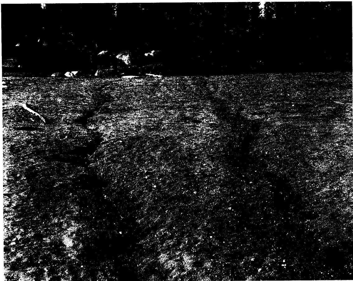
FIG. 3. Calvaras county, 1899. About 3 km (2 miles) south west of Bloods. Sandy ridge grazed clean and bare by sheep, gullying.