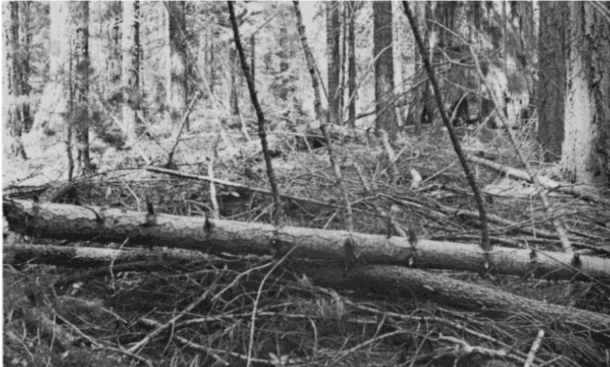
Fig. 1. Long-term fire prevention permits fuel accumulations as seen here in Trail Area, Kings canyon National Park. In such areas, broadcast burning is precluded because of the risk involved.