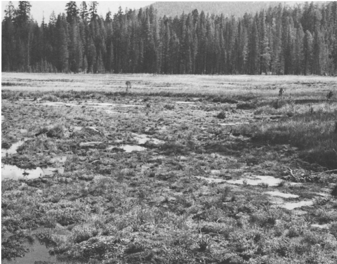
Fig. 1.-Lowered surface level, puddling and vegetation establishment are all evident 1 year after fire in Ellis Meadow. The background shows an unburned portion of the meadow.

The weather during the 4-year study period following the fire was quite variable. The water content of the 1 April snow pack near Ellis Meadow was 180%, 97%, 147% and 75% of the 15-year average in 1978, 1979, 1980 and 1981, respectively. Although summer thundershowers contribute only a small proportion of the water to subalpine meadows in the Sierra Nevada, their timing may be critical to the presence and abundance of certain species.