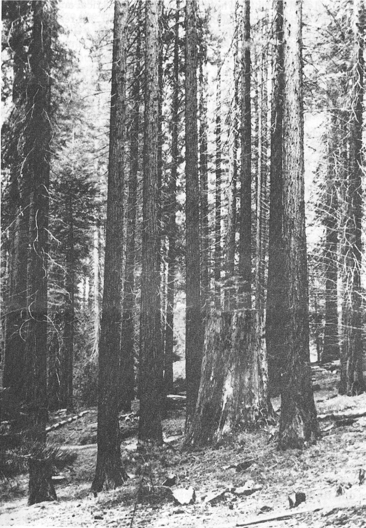
Fig. 1. Whitaker's Forest, showing the stand structure of young-growth giant sequoia. The stump in the foreground is a remnant of a large diameter sequoia cut in the 1870's.