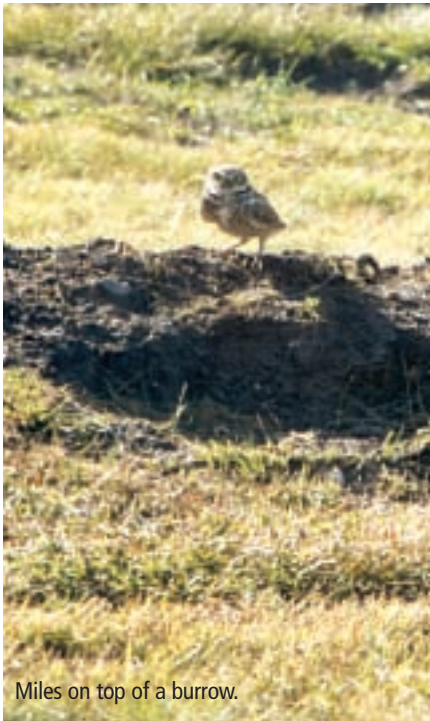
Miles on top of a burrow.

purpose of studying winter migration of burrowing owls. Since then, the burrows have been home to several owls that have traveled from as far away as Canada.