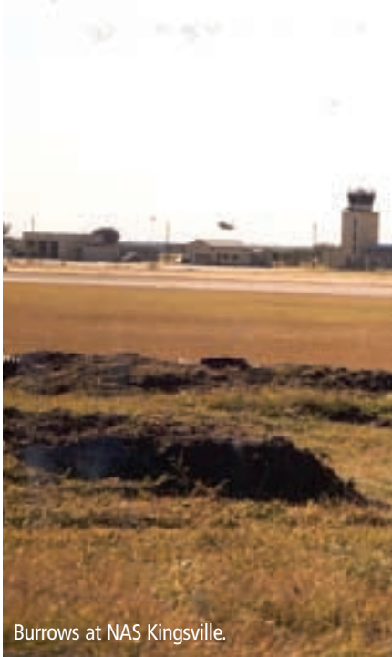
Burrows at NAS Kingsville.