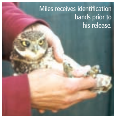
Miles receives identification bands prior to his release.

Several artificial burrows were placed on Navy property in Kingsville and Orange Grove in August 2001 for the