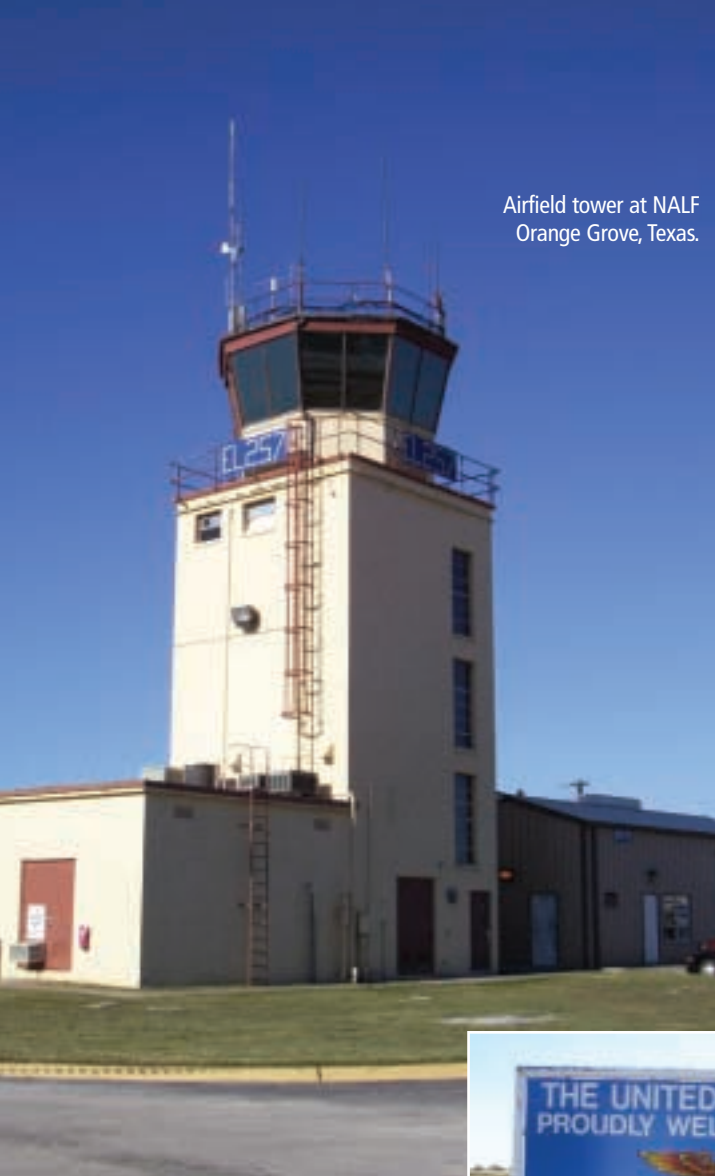
Airfield tower at NALF Orange Grove, Texas.