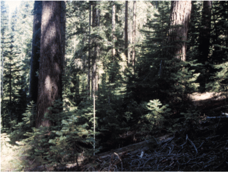
Figure 3.15-1. Preburn view of red fir plot 3.