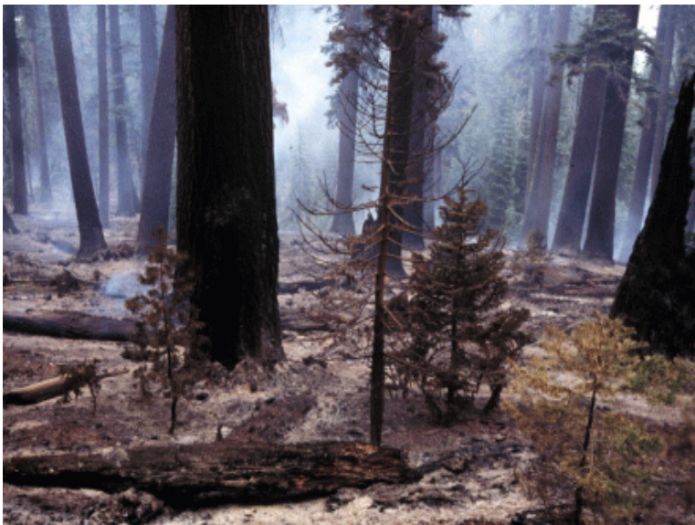
Figure 3.15-2. Postburn view of plot 3 (view is not a photo pair with Fig. 3.15-1).