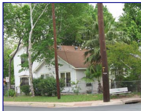
Small residential group quarters often blend into single family neighborhoods and are incorrectly enumerated. In the 2006 test, this house in the Austin, TX, test site was not counted as a group quarters.

For the 2006 test, Census addressed some of the problems we identified in 2004. It developed and verified a list of group quarters (which included several colleges and universities, and a state prison), and either helped residents complete the form, left census questionnaires to be picked up at a later time, or used administrative records to fill in the needed information. Even so, the response rate among college students was low: only 719 of 6,700 (11 percent) of the questionnaires were returned. We recommended, among other things, that Census evaluate its distribution methods to see if they contributed to the low return rate and explore using student e-mail addresses and an Internet response option to promote a greater return. To date, Census has not explored these options, citing cost, privacy, and security concerns.