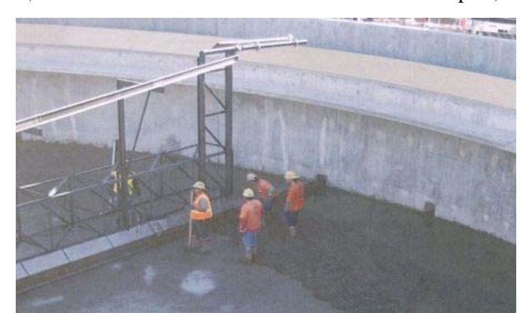
Photo 1: Construction of secondary clarifier, City of Petaluma, California.

shows workers finishing the bottom of a secondary clarifier at the Ellis Creek Water Recycling Facility, City of Petaluma, California. The photograph allows the project manager to see the construction activity in progress and the construction techniques and methods used. The project manager can then make an assessment on the percentage completed, and compare to progress payments made to date.