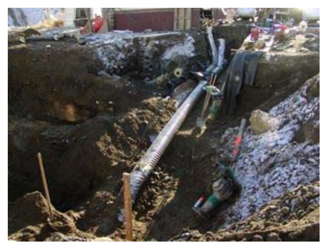
Photo 2: Nome Water and Sewer Project, Nome, Alaska (photo courtesy Alaska Department of Environmental Conservation).

difference in being able to track remote projects. Photo 2 shows construction activity at the Nome Water and Sewer Project, over 1,100 miles from the project manager in Juneau. Alaska can obtain such information almost instantly by e-mail, and can address questions and problems quickly and efficiently. The ability to obtain written status reports quickly with attached documentation and photographs has minimized the need to travel into the field for inspections. Alaska uses these e-mails, documentation, and photographs as part of the official State files.