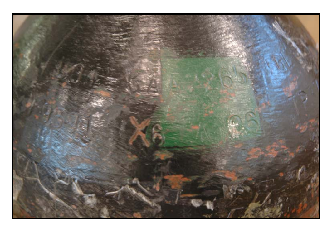
Figure 2: Indented marking on the DOT-3AA cylinder