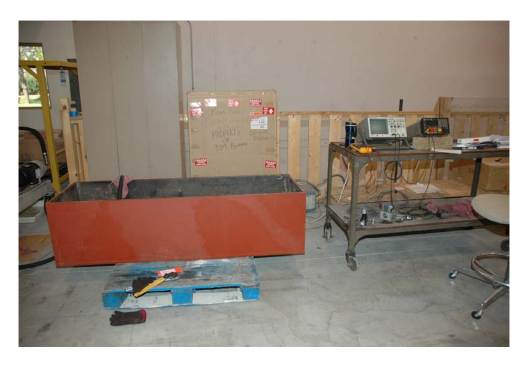
Figure 4: Test set up for pressure cycling test of DOT-3AA cylinder