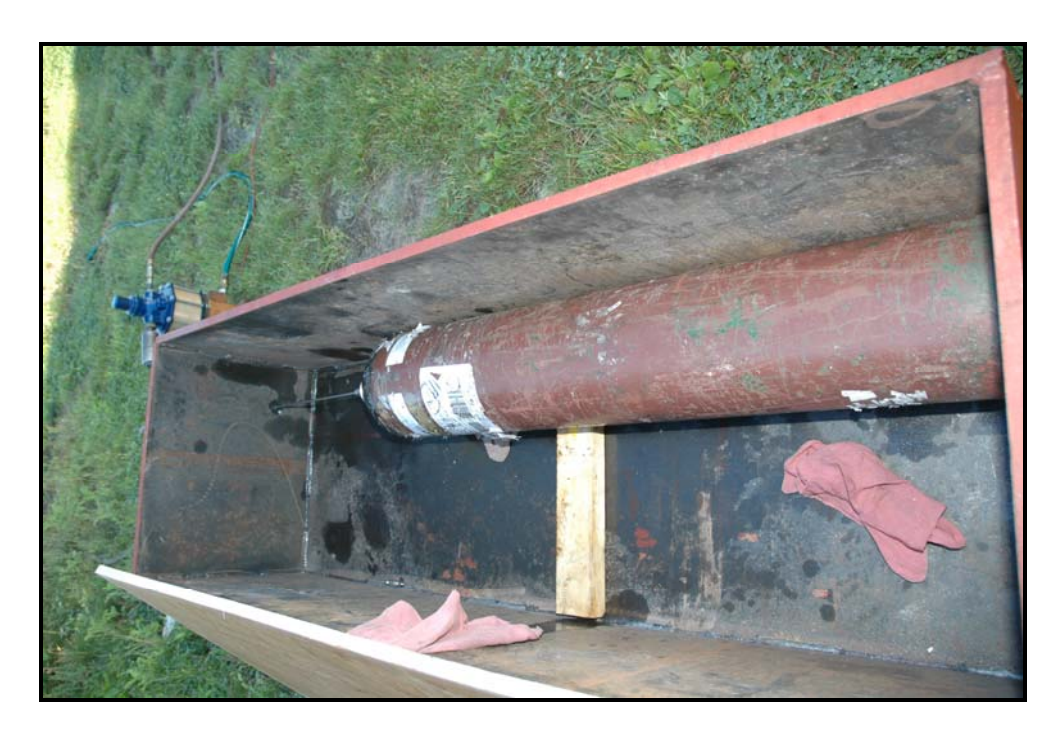
Figure 6: Test set up for hydraulic burst testing.