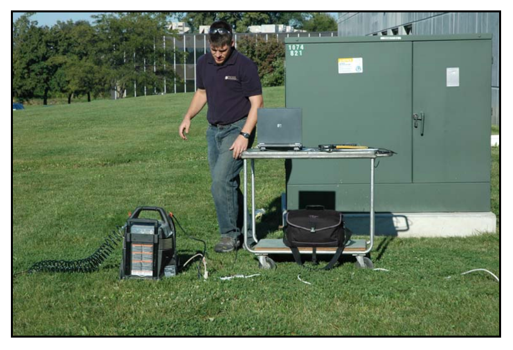
Figure 9: Test set up for hydraulic burst testing.