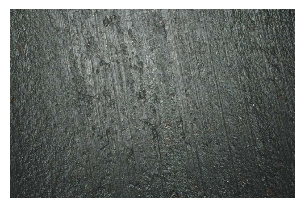
Figure 3: Inside surface of the DOT-3AA cylinder. No major corrosion observed.