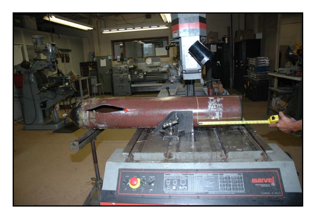
Figure 13: Location from which the samples were cut for mechanical property evaluation.