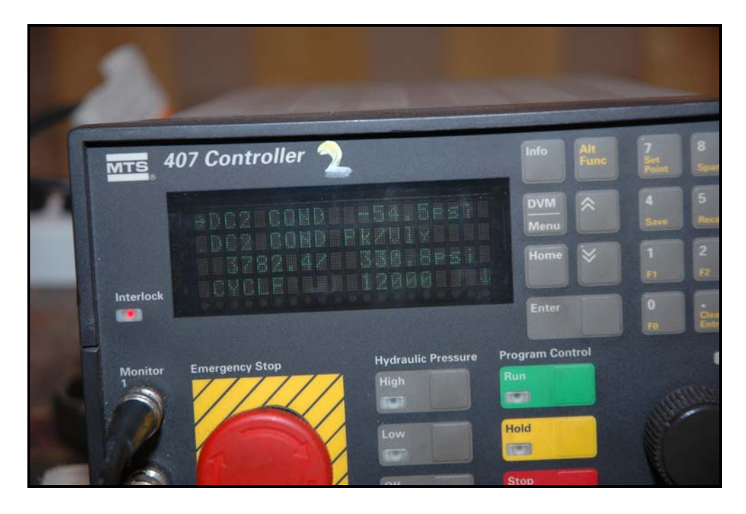
Figure 5: Shows the maximum/minimum pressure and cycles completed during cyclic testing of the DOT – 3AA cylinder.