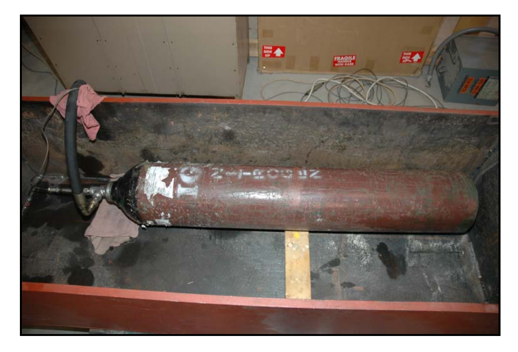
Figure 1: DOT-3AA cylinder as received.