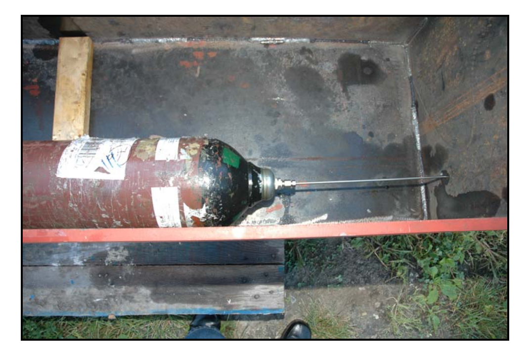
Figure 7: Test set up for hydraulic burst testing.