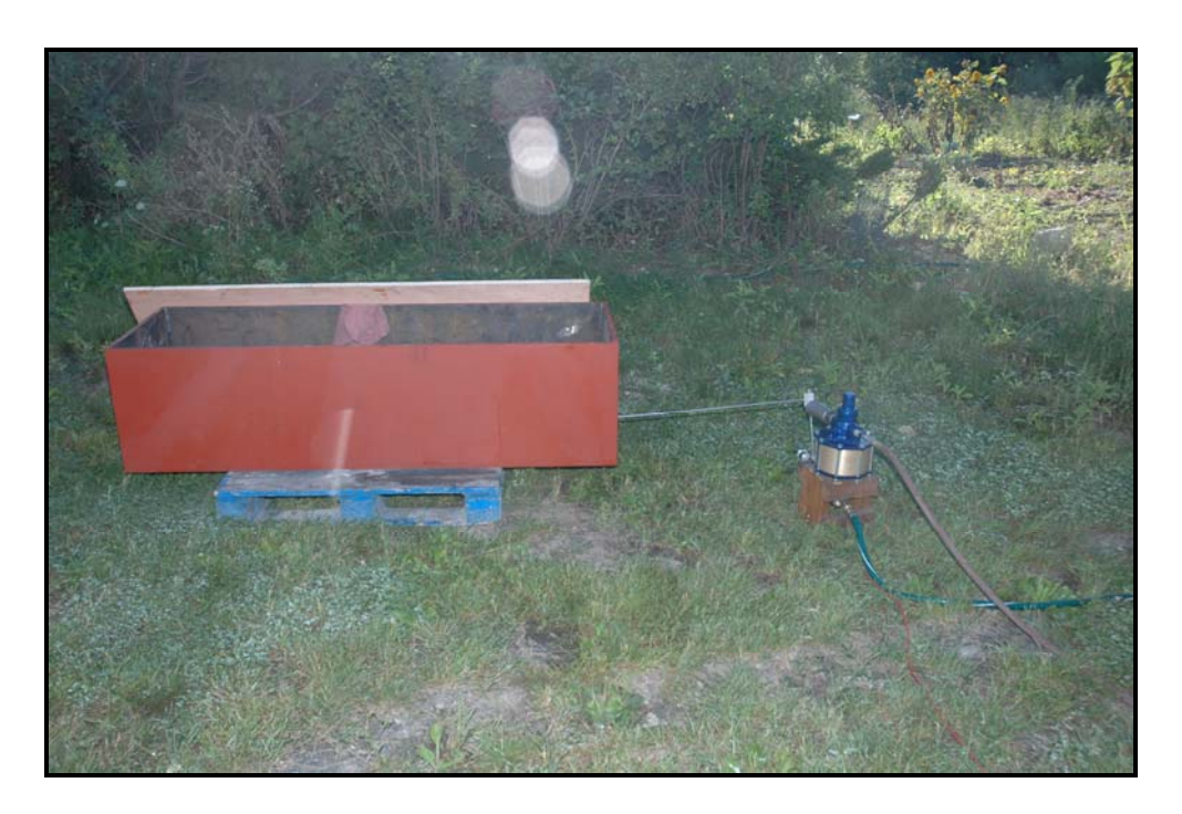
Figure 8: Test set up for hydraulic burst testing.