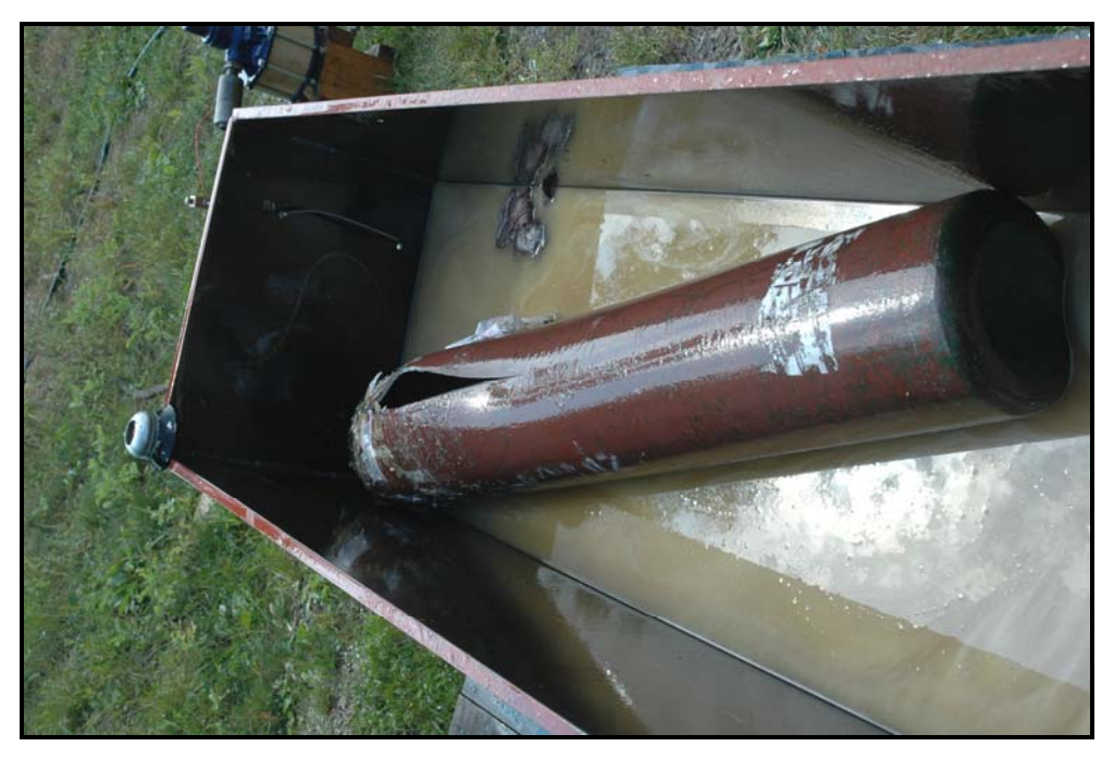
Figure 11: Ruptured cylinder after hydraulic burst testing.