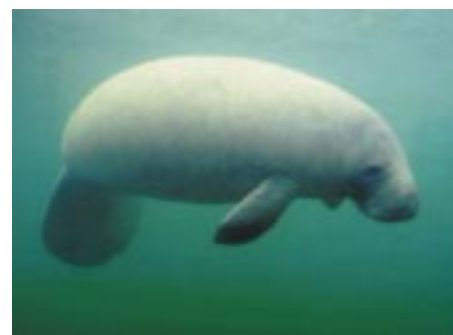
Figure 5. Manatee in Florida waters.

USGS biologists are conducting long-term studies on the manatee's life history, population dynamics, and ecological requirements, and have pioneered several important tools, including a computerized photo-identification catalog and a radio-tag assembly for tracking manatees by sat-