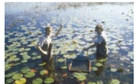
Figure 2. USGS hydrologists sampling plants in the Everglades.

The ground- and surface-water resources of the lower Suwannee River basin (fig. 3) provide a variety of important benefits to north-central Florida. Although these resources have not been highly developed, demands are likely to increase from users within the basin, from within the Suwannee River Water