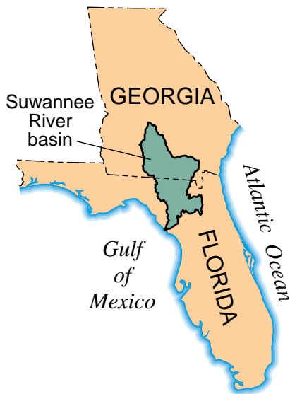
Figure 3. Study area of the Suwannee River Basin project.

Management District (SRWMD), and possibly from more populous areas of Florida. The SRWMD entered into a cooperative program with the USGS to study factors affecting water resources in the basin. Current activities include interpretive studies of surface- and ground-water interactions, and of the relation between wetland habitats and flow characteristics in the River. Ground-water and surface-water interactions in the Suwannee River basin are complex because of the karstic hydrologic conditions in the basin. Evaluating the effects of increased development in and near the lower Suwannee River basin requires an understanding of the dynamics of water exchanges between the lower Suwannee River, its tributaries, and the Floridan aquifer system. USGS hydrologists are developing computer-based models to simulate ground- and surface-water interactions. Environmental isotopes and age dating techniques are being used to determine the sources and chronology of nitrate contamination of springs in the basin. Also, an effort is underway to determine the relation between sources of nitrate in spring waters and changes in land-use patterns over the past 50 years.