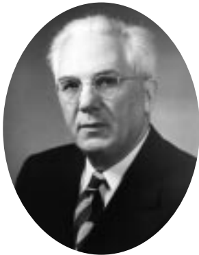
Homer Ferguson (Michigan) 1954