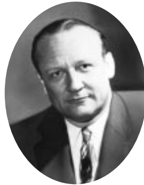
William F. Knowland (California) 1953