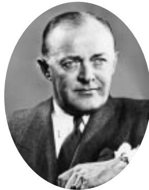
H. Styles Bridges (New Hampshire) 1955-1961