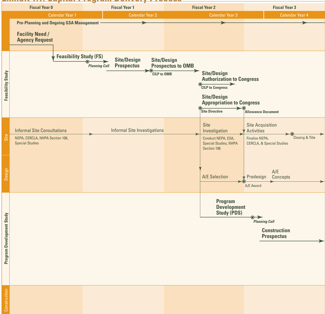
Exhibit 1.1: Capital Program Delivery Process