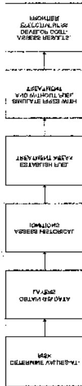
Figure 2. Flow chart for prototype cost-effectiveness simulator.

Results were analyzed graphically ( fig. 1 ). The "cost-effectiveness frontier" identifies the trace of greatest reductions in burned area per dollar spent in fuel treatment. In this example one point on this path involves treatment of segment 4 with a cost of $8,952 and burned area reduction of 396 ha ( table 1 ). Alternatively, a manager could treat segments 2 and 4 for a cost of $11,621 and realize a burned area reduction of 813 ha; or he/she could treat segments 1 and 4 for a cost of $16,632 and burned area reduction of 1,658 ha. The most expensive alternative, treatment of all segments (1-4), would cost $18,860 and reduce burned area by 2,092 ha. Treatment levels interior to the frontier are less cost-effective.