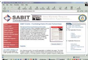
Screenshot of the redesigned SABIT website.

We are pleased to present an important new tool for the U.S. business and scientific communities - the enhanced SABIT website will make our funding opportunities, informational resources, and services much more accessible to all of those who use them. The private sector has made great improvements in customer service, in part because of technological innovation. Government has sometimes lagged behind. With the redesign of our website, we make a great stride forward. [Continued on page 3]