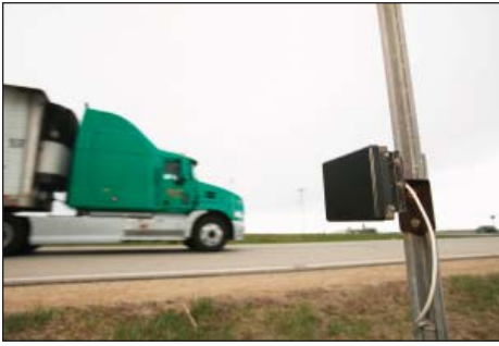
A compact radar sensor, part of the integrated sensor network monitoring traffic approaching the intersection on the rural highway.

This sensor system, installed at a rural intersection in southern Minnesota, was used to collect data to help researchers better understand driver gap decision-making behavior and the different ways in