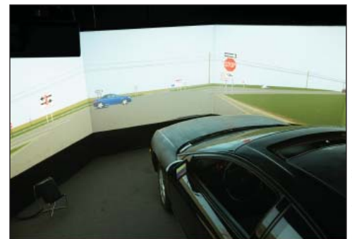
The HumanFIRST Program's immersive driving simulator enabled researchers to test a variety of infrastructure-based driver interface concepts.

Researchers from the Institute's Intelligent Vehicles Lab designed a sensor network, incorporating multiple radar units mounted along the high-speed expressway, that can track approaching vehicles and determine whether gaps between them are sufficient for a stopped vehicle to safely enter or cross the highway. A methodology was also developed to identify candidate intersections for the technology.