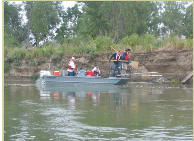
Texas Fish crew sampling the Upper Missouri River

but are not normally found in Texas like the walleye, northern pike, and sturgeon. However, they had their fill of dizzard shad (too many to count) by the end of the sampling season. They gave a "thumbs up" to North Dakota scenery and