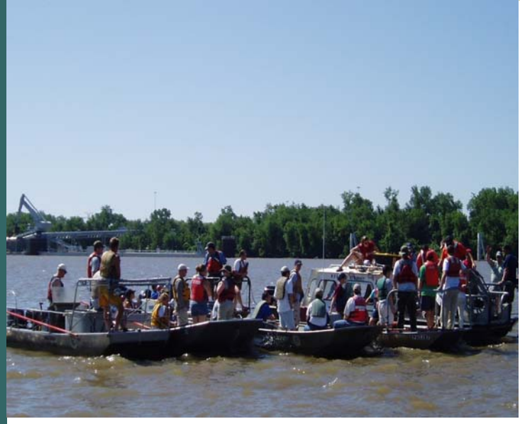
A flotilla of training in pool 26 (Alton, IL) on the Mississippi River in 2005.

THE ENVIRONMENTAL MONITORING AND ASSESSMENT PROGRAM FOR GREAT RIVER ECOSYSTEMS (EMAP-GRE)