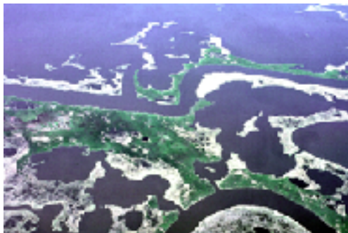
Marsh loss along the Blackwater River in Maryland has accelerated since the 1950s.

A recent study found that within the US Fish and Wildlife Service's Blackwater National Wildlife Refuge alone, over 6 square miles of marsh have been lost to open water, and 53 percent of remaining marsh has suffered significant damage and will likely be lost in the near future.