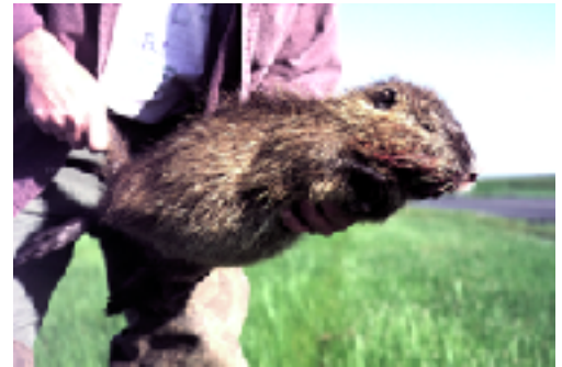
Large (8-18 lb) beaver-like rodent; 5 to 10 times as large as our native muskrat; Accidentally introduced to Maryland in 1940's