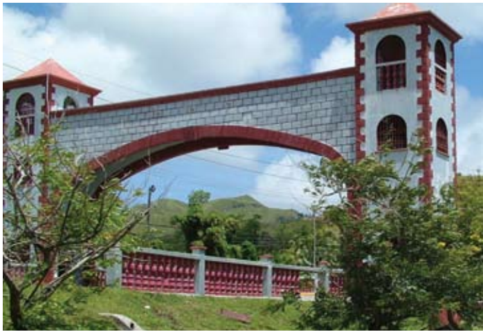
Old Spanish Bridge in Umatac, Guam.

The northern border of the United States stretches more than 5,000 miles from Maine in the East to Alaska in the West. There are 13 states on the border with Canada. The Treaty of Paris of 1783 established the official boundary between Canada and the United States after the Revolutionary War. Since that time, there have been land disputes, but they have been resolved through treaties. The International Boundary Commission, which is headed by two commissioners, one American and one Canadian, is responsible for maintaining the boundary.