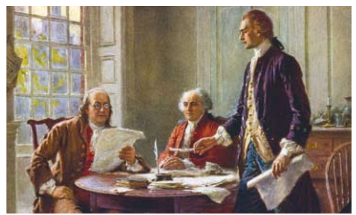
Benjamin Franklin, John Adams, and Thomas Jefferson in "Writing the Declaration of Independence, 1776," by Jean Leon Gerome Ferris.

The Declaration of Independence lists three rights that the Founding Fathers considered to be natural and "unalienable." They are the right to life, liberty, and the pursuit of happiness. These ideas about freedom and individual rights were the basis for declaring America's independence. Thomas Jefferson and the other Founding Fathers believed that people are born with natural rights that no government can take away. Government exists to protect these rights. Because the people voluntarily give up power to a government, they can take that power back. The British government was not protecting the rights of the colonists, so the colonies took back their power and separated from Great Britain.