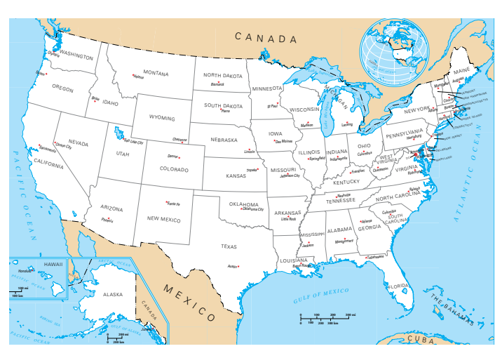
Map of the United States including state capitals.

The Constitution did not establish political parties. President George Washington specifically warned against them. But early in U.S. history, two political