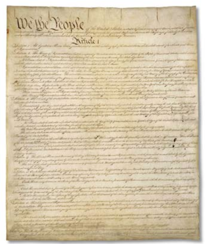
The Constitution of the United States.

The Constitution, written in 1787, created a new system of U.S. government—the same system we have today. James Madison was the main writer of the Constitution. He became the fourth president of the United States. The U.S. Constitution is short, but it defines the principles of government and the rights of citizens in the United States. The document has a preamble and seven articles. Since its adoption, the Constitution has been amended (changed) 27 times. Three-fourths of the states (9 of the original 13) were required to ratify (approve) the Constitution. Delaware was the first state to ratify the Constitution on December 7, 1787. In 1788, New Hampshire was the ninth state to ratify the Constitution. On March 4, 1789, the Constitution took effect and Congress met for the first time. George Washington was inaugurated as president the same year. By 1790, all 13 states had ratified the Constitution.