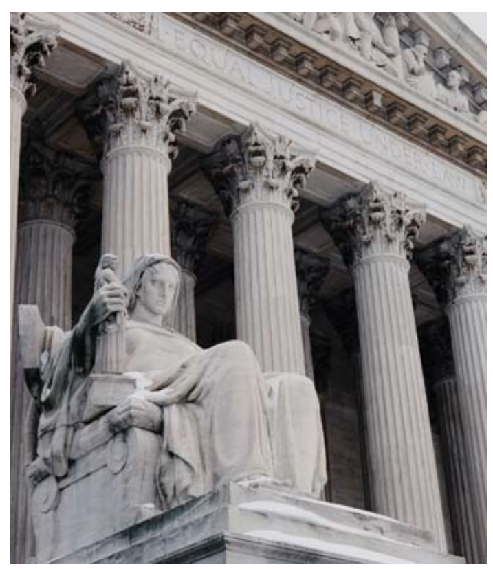
The Contemplation of Justice statue outside the U.S. Supreme Court building in Washington, D.C.

The judicial branch is one of the three branches of government. The Constitution established the judicial