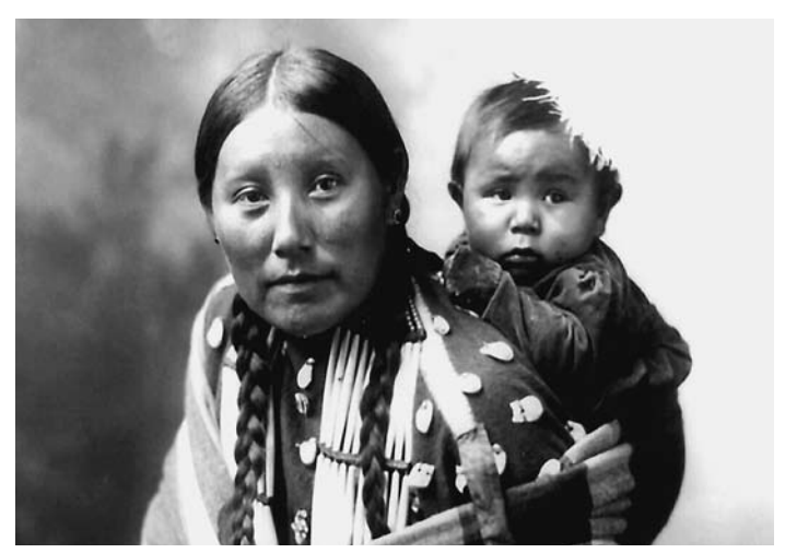
American Indian woman and her baby in 1899. Courtesy of the Library of Congress, LC-USZ62-94927.

On September 11, 2001, four airplanes flying out of U.S. airports were taken over by terrorists from the Al-Qaeda network of Islamic extremists. Two of the planes crashed into the World Trade Center's Twin Towers in New York City, destroying both buildings. One of the planes crashed into the Pentagon in Arlington, Virginia. The fourth plane, originally aimed at Washington, D.C., crashed in a field in Pennsylvania. Almost 3,000 people died in these attacks, most of them civilians. This was the worst attack on American soil in the history of the nation.