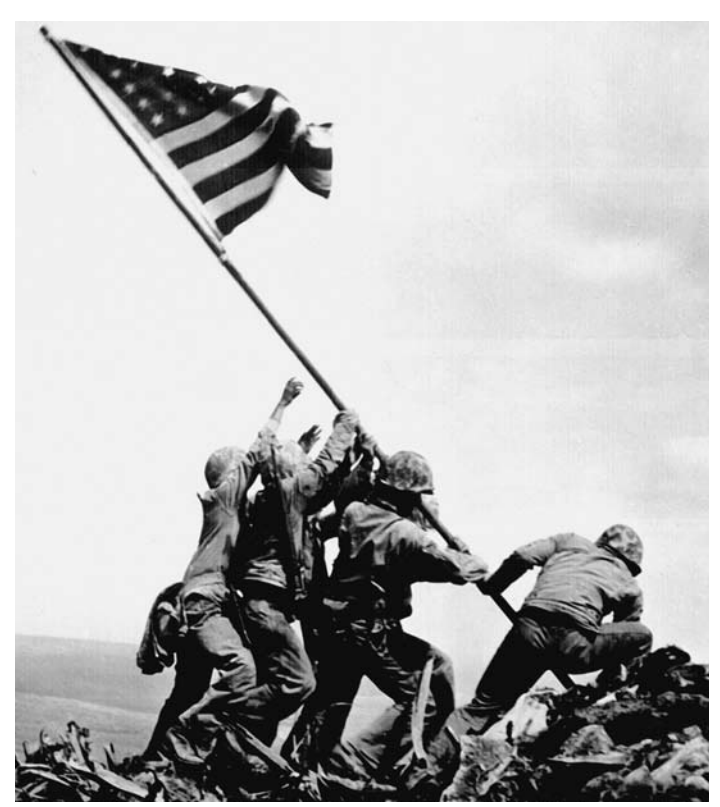
"Raising the Flag on Iwo Jima," photographed by Joe Rosenthal, Associated Press, 1945.

From 1959 to 1975, United States Armed Forces and the South Vietnamese Army fought against the North Vietnamese in the Vietnam War. The United States supported the democratic government in the south of the country to help it resist pressure from the communist north. The war ended in 1975 with the temporary separation of the country into communist North Vietnam and democratic South Vietnam. In 1976, Vietnam was under total communist control.