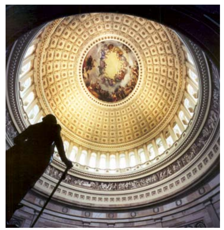
The Rotunda of the U.S. Capitol.

Congress is divided into two parts—the Senate and the House of Representatives. Because it has two "chambers," the U.S. Congress is known as a "bicameral" legislature. The system of checks and balances works in Congress. Specific powers are assigned to each of these chambers. For example, only the Senate has the power to reject a treaty signed by the president or a person the president chooses to serve on the Supreme Court. Only the House of Representatives has the power to introduce a bill that requires Americans to pay taxes.