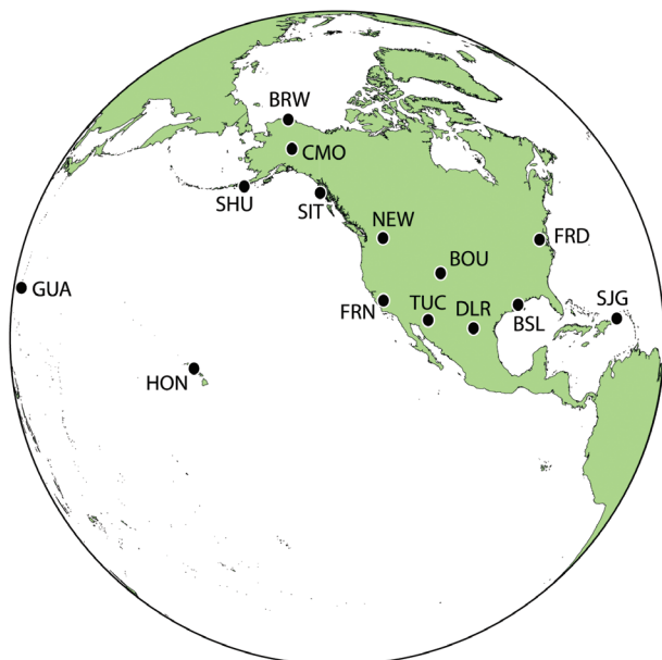
Figure 3. The locations of USGS geomagnetic observatories, with three-letter abbreviations of the observatory names.