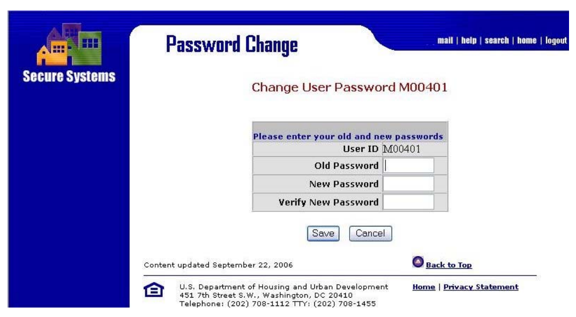
Figure 3-3 Changing Password

Once you have access to the system, you should use the Change Password function to change your password every 60 days or less.