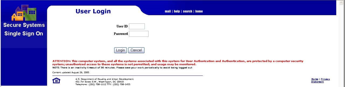
Figure 3-1 User Login Screen