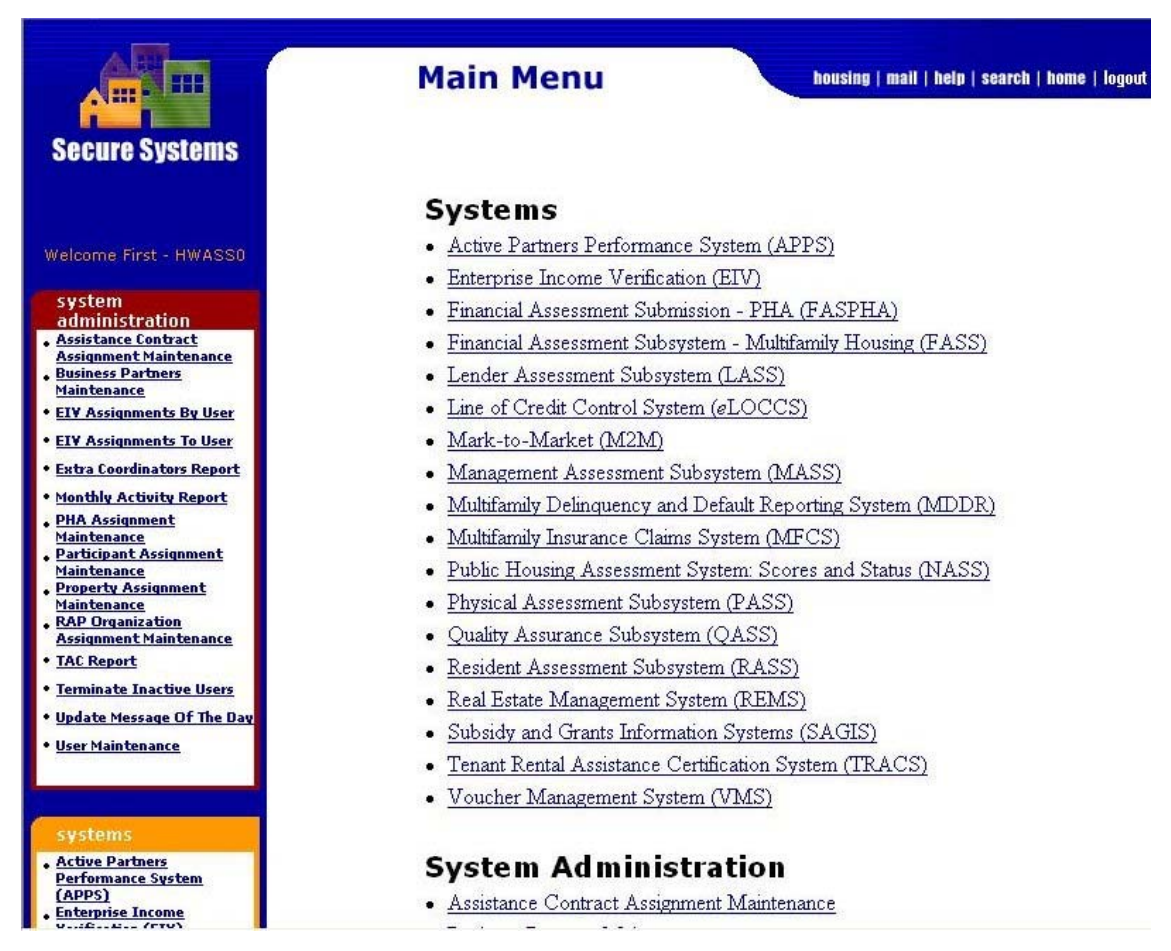
Figure 3-4 Logout

When you are finished your session, you should logout of the system by selecting "logout." This option is found in the upper-right hand corner of the web page, as shown in Figure 3-4 below. Once you have selected "logout," WASS will encourage you to close all of your browser windows. Closing all of your browser windows is your means to ensure that someone else does not use your system access privileges while you are away from your computer.