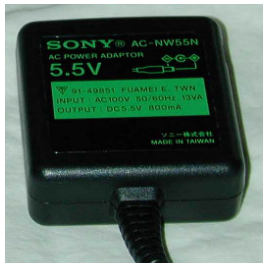
Figure 1– Example of Ac-Dc Power Supply Nameplate Output Voltage and Current

Additional load conditions may be selected at the technician’s discretion, as described in IEEE 1515-2000, but are not required by this test procedure.