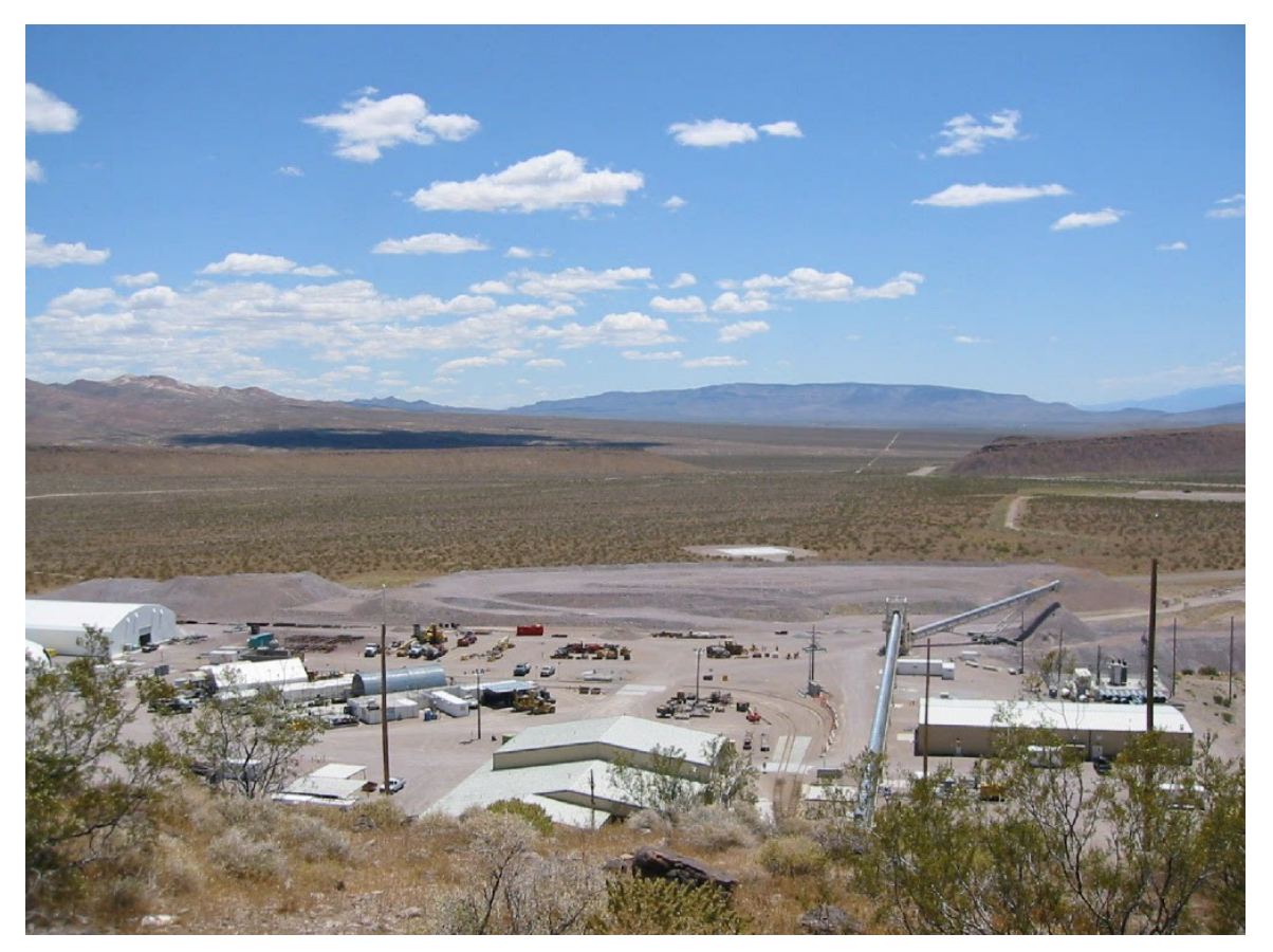
The excavation and development facilities at Yucca Mountain.

Disposal of High-Level Radioactive Wastes in a Geologic Repository at Yucca Mountain, Nevada, 10 CFR 63, prescribes the rules governing the licensing of DOE to receive and possess HLW nuclear material at a geologic repository operation sited at Yucca Mountain, Nevada. Part 63 also sets forth the rules that will be followed for site characterization and licensing, as well as pre- and post-closure activities.