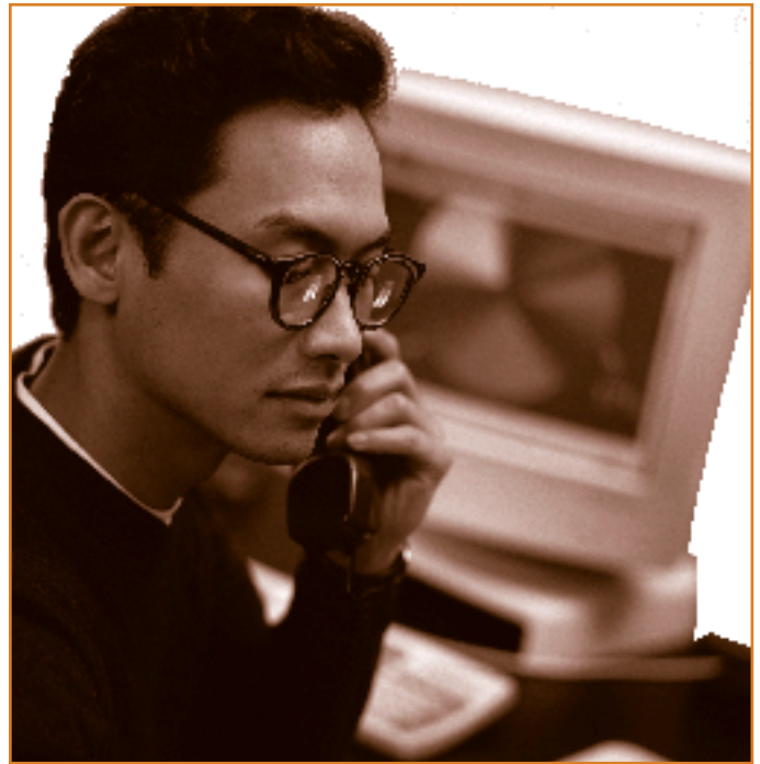
Human resources workers help to recruit and hire workers and to plan for future workforce needs.

Chief executives. Chief executives' duties vary from one association to another. In a larger association, they might direct a number of other managers, each of whom is responsible for part of the organization's operations, or serve as spokespeople for their organizations to help raise funds. In a small association, executives are likely to direct many or all of these functions themselves and to juggle many responsibilities simultaneously; as the only