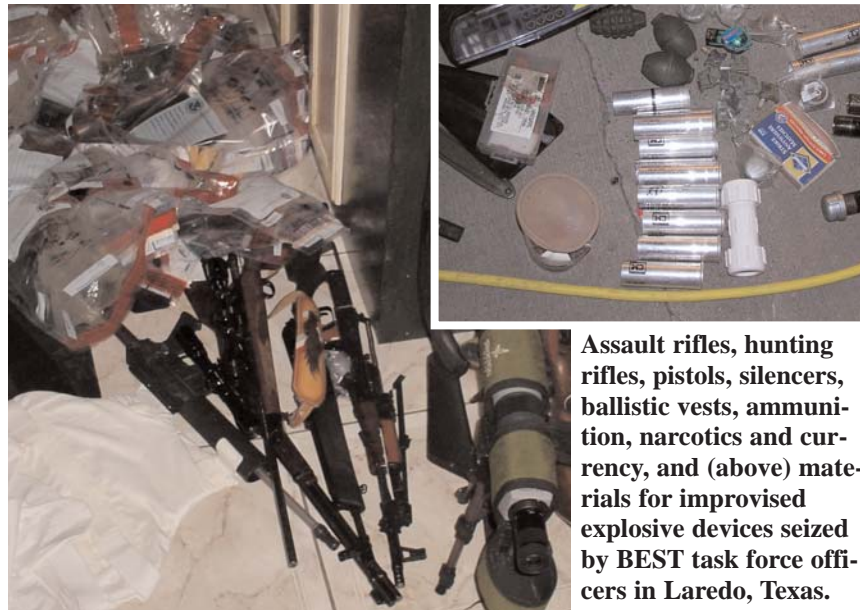
Assault rifles, hunting rifles, pistols, silencers, ballistic vests, ammunition, narcotics and currency, and (above) materials for improvised explosive devices seized by BEST task force officers in Laredo, Texas.

In addition, on January 12, BEST team members arrested another Laredo resident after executing a search warrant on his home where they found firearms and narcotics. Agents seized roughly 400 pounds of marijuana, two AK-47 assault weapons, two Uzi assault weapons, a silencer and approximately $5,000.