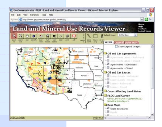
Land & Mineral Map Viewer

Connect to the GeoCommunicator website at <a href="http://www.geocommunicator.gov">http://www.geocommunicator.gov</a>. Use Internet Explorer as your browser. Pop-Ups must be allowed.