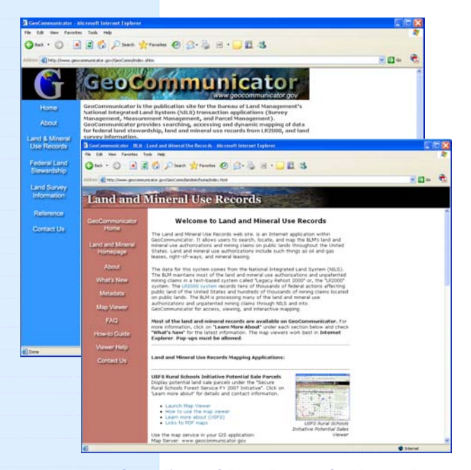
Land & Mineral Use Records Home Page

The Land and Mineral Use Records interactive map is available through the BLM's GeoCommunicator website and contains information from the BLM's National Integrated Land System (NILS) and the Legacy Rehost System (LR2000). Oil & gas, coal, and other mineral leasing, ROW, conveyances, and mining claims issued or recorded by the BLM are now available in the map viewer or as an Internet map service, accessible from any computer with access to the Internet. The following instructions will guide you through an interactive web mapping session where you can search for oil & gas (O&G) data and integrate it with other spatial reference themes from the BLM and USGS.