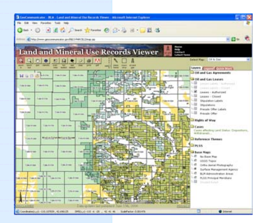
Search Using Map Tools