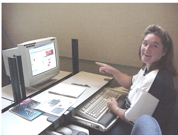
Through the workshop, future and current teachers became familiar with the power of GIS technology and methods, and learned about ways to implement GIS in their own classrooms.

In August, educators gathered for two days of GIS training through a geography teaching course.