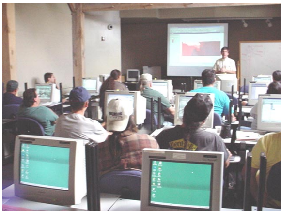
Each workshop is a hands-on experience using Geographic Information Systems software by ESRI, Inc.