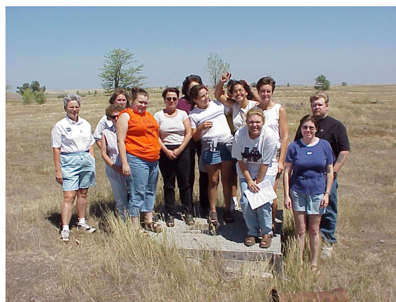
Each workshop includes a segment on collecting field data and coordinates with Global Positioning Systems (GPS).