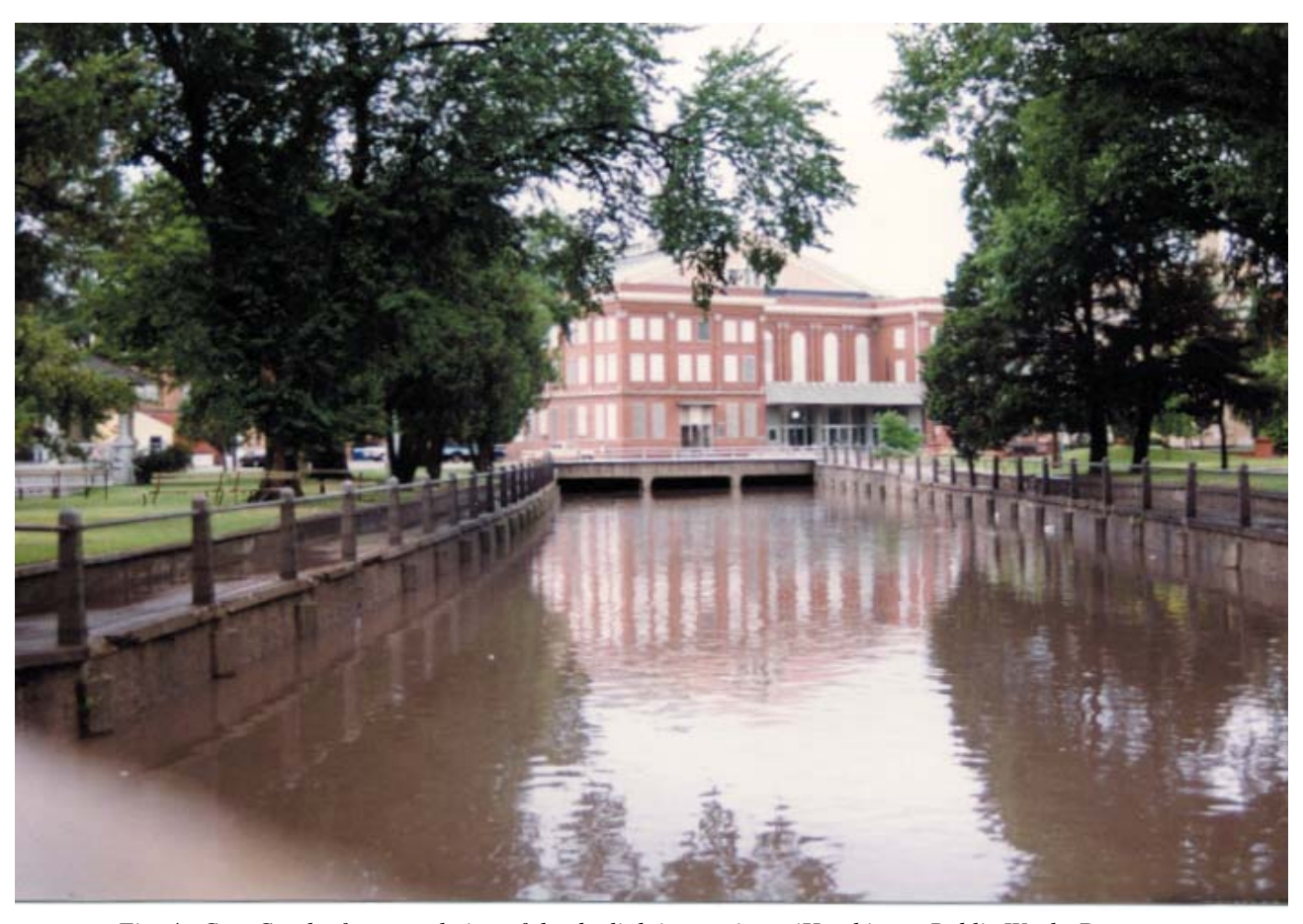
Fig. 4. Cow Creek after completion of the daylighting project.