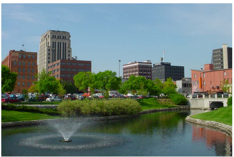
Fig. 2. The Festival Site also acts as a flood-control reservoir during winter high flows.