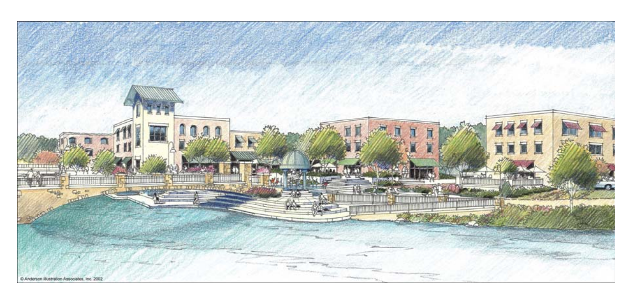
Fig. 6. Artist's rendering of the completed Fox River/St. Charles riverfront restoration project. (Hitchcock Design Group. Reprinted with permission.)

<sup>5</sup> Source: Personal communication, St. Charles development staff.