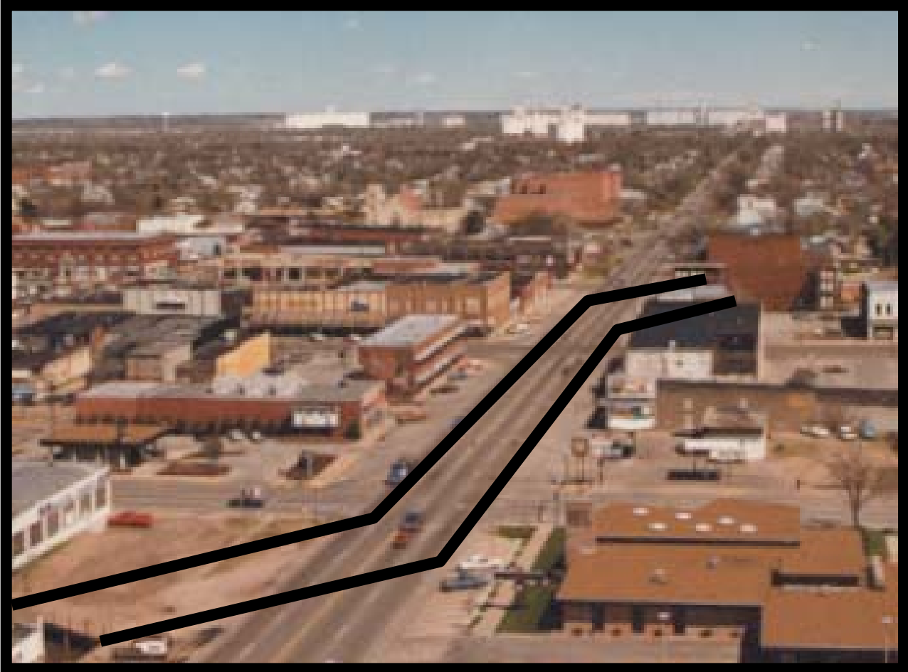
Fig. 3. Cow Creek (Avenue A) before the daylighting project began.

provided the funds for the merry-go-round. The play area remains part of the master plan, even though at this point Munger admitted that a funding source for it is still unknown.