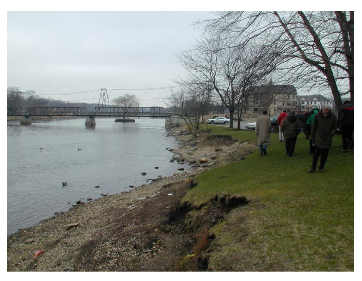
Fig. 5. Fox River/St. Charles riverfront before restoration began. (Hitchcock Design Group. Reprinted with permission.)