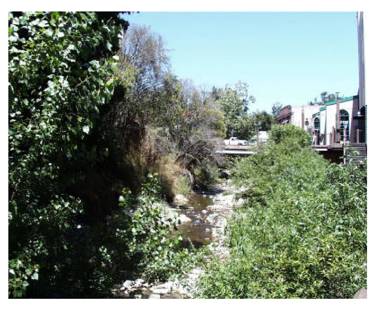
Fig. 7. San Luis Obispo's Creek before the restoration project began.