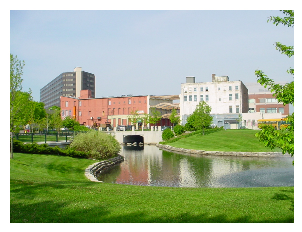
Fig. 1. The "Festival Site," a key component of the completed daylighting project for Arcadia Creek in Kalamazoo, MI.