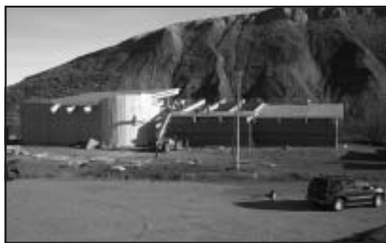
Workers install roof panels on the new interpretive center in Fort Benton.

The Bureau of Land Management, City of Fort Benton, and The River and Plains Society are partners in the interpretive center. The BLM will pay for construction, permanent fulltime staffing, and part of the operation and maintenance of the