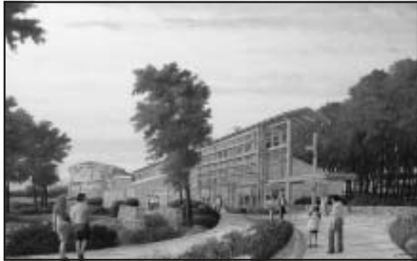
Artist's rendering of the Pompeys Pillar National Monument Interpretive Center.

This year, the Montana/Dakotas BLM is very pleased to invite you to visit its two new interpretive centers for Pompeys Pillar National Monument and the Upper Missouri River Breaks National Monument. And, not entirely by coincidence, these two centers have connections to the Lewis and Clark Bicentennial, which is in its final year.