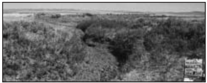
ABOVE: Larb Creek was “functioning-at-risk” in 1996 when the initial riparian survey was done.