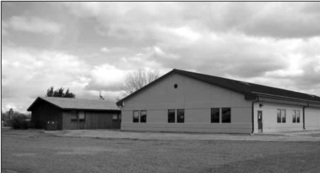
The original Miles City building (left) will be remodeled to match the new addition (right) as closely as possible.

One interesting aspect of the pilot involves positions at partner agencies. Many times we need input from another state or federal agency before we can complete the environmental review of an oil or gas proposal. But if that agency is short on staff, a bottleneck can result. Under the Energy Act pilot, we have the capability to fund positions in other agencies. In the Miles City pilot, we have already provided funding for the U.S. Fish and Wildlife Service to hire a biologist. Agreements are also in the works for the Montana Department of Fish, Wildlife and Parks to hire an additional biologist and for the Montana Department of Environmental Quality