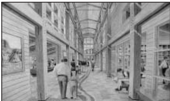
Artist's rendering of the inside of the Pompeys Pillar National Monument Interpretive Center.

The Pompeys Pillar Interpretive Center will open Memorial Day weekend. Exhibits in the 5,700-square foot center relate the journey of Captain William Clark and his detachment, including Sacajawea and her son Pomp, down the Yellowstone River Valley in 1806. On July 25, 1806, Clark carved his signature into a 121-foot sandstone bluff 28 miles northeast of present-day Billings, Montana. He called the bluff Pompey's Tower; it is the only known physical evidence of the Lewis and Clark Expedition still visible along the trail. The center doesn't focus only on Clark's