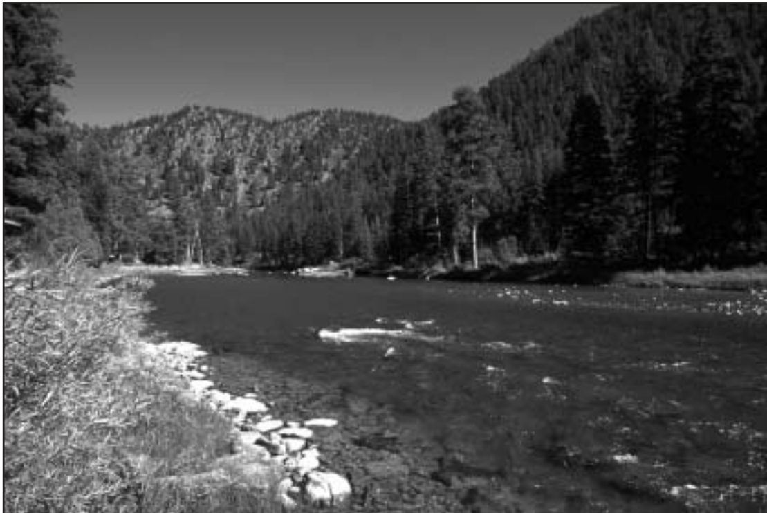
Nearly 5,500 acres were added to the public land base in the Missoula Field Office last year through the Blackfoot Challenge partnership and funded with the Land and Water Conservation Fund.

An interesting footnote is that the Blackfoot Challenge is slated to purchase 5,600 acres as a “Community Conservation Area” to serve as a model for land management practices. The area south of Ovando Mountain is highly valued by neighboring residents for public access, forest products and wildlife. Stay tuned to see how this dynamic partnership tackles the challenge of managing land for public use.