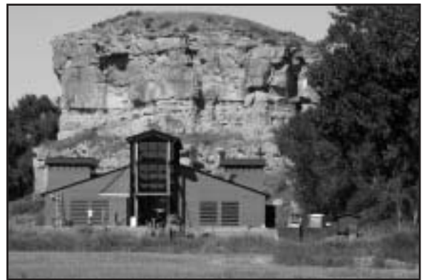
Work progresses on the new Pompeys Pillar National Monument Interpretive Center.

The BLM purchased Pompeys Pillar in 1991 for its historic significance and its interpretive and recreational potential. In 1992, the BLM constructed limited facilities for the protection of resources and the comfort and safety of visitors. Facilities included a small log contact station and