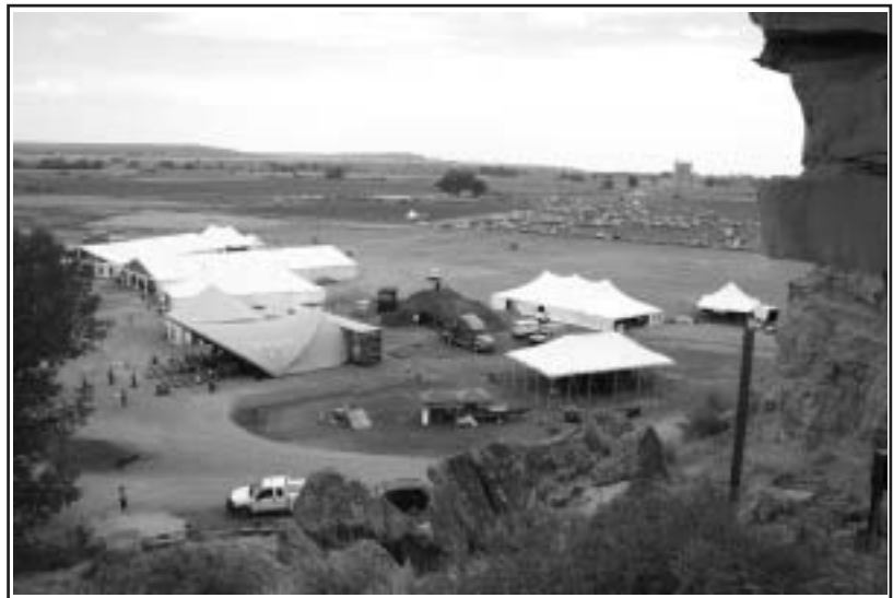
The "tent city" as seen from the boardwalk at Clark's signature. The hayfield-turned-parking lot is in the distance.