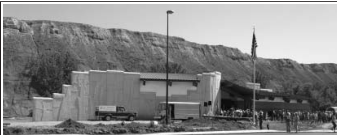
The center's concrete outer wall mimics the famed White Cliffs of the Upper Missouri.

Undaunted Stewardship is helping to fund the new trail that will connect with, and become an extension of, Fort Benton's walking trail that fronts the Missouri across much of the town. The trail is expected to be completed this fall.