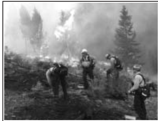
The holding crew waits "in the black" during spring burning for the project area that is the focus of numerous studies by MSU graduate students.