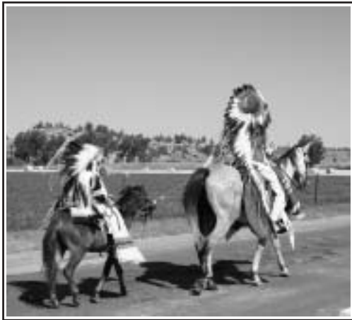
The Crow Nation Parade of Honor on July 25.