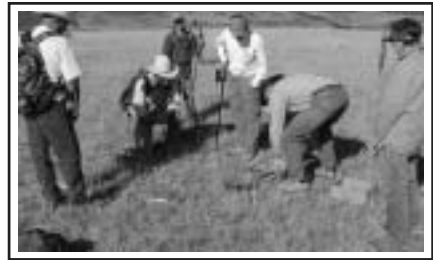
Volunteers search an area near Ruby Reservoir in southwest Montana trying to locate an 1838 skirmish site.

The Dillon Field Office has received special funding from the commemoration of the 100th anniversary of the Antiquities Act to develop an interpretive display at the Ruby Creek Campground which will be devoted to describing the battle and the historical utilization of the Madison Valley by the Blackfeet Tribe.