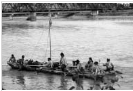
Members of the Discovery Expedition re-enact Clark's landing at Pompeys Pillar.