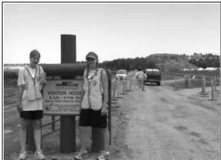
Dedicated volunteers welcome visitors to Clark on the Yellowstone. Parking lot duty was just one of the many critical tasks that volunteers capably handled during the event.