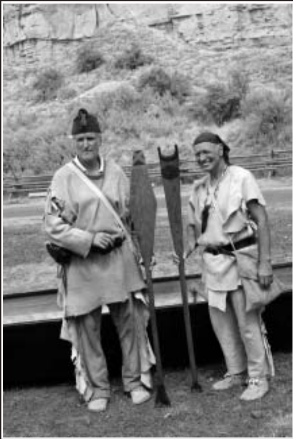
Members of the National Park Service's Corps II exhibit.