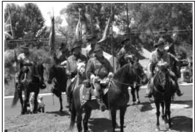
Steele's Scouts were on hand for the dedication.