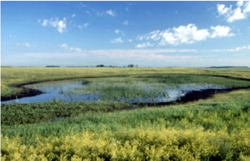
North Dakota Pothole