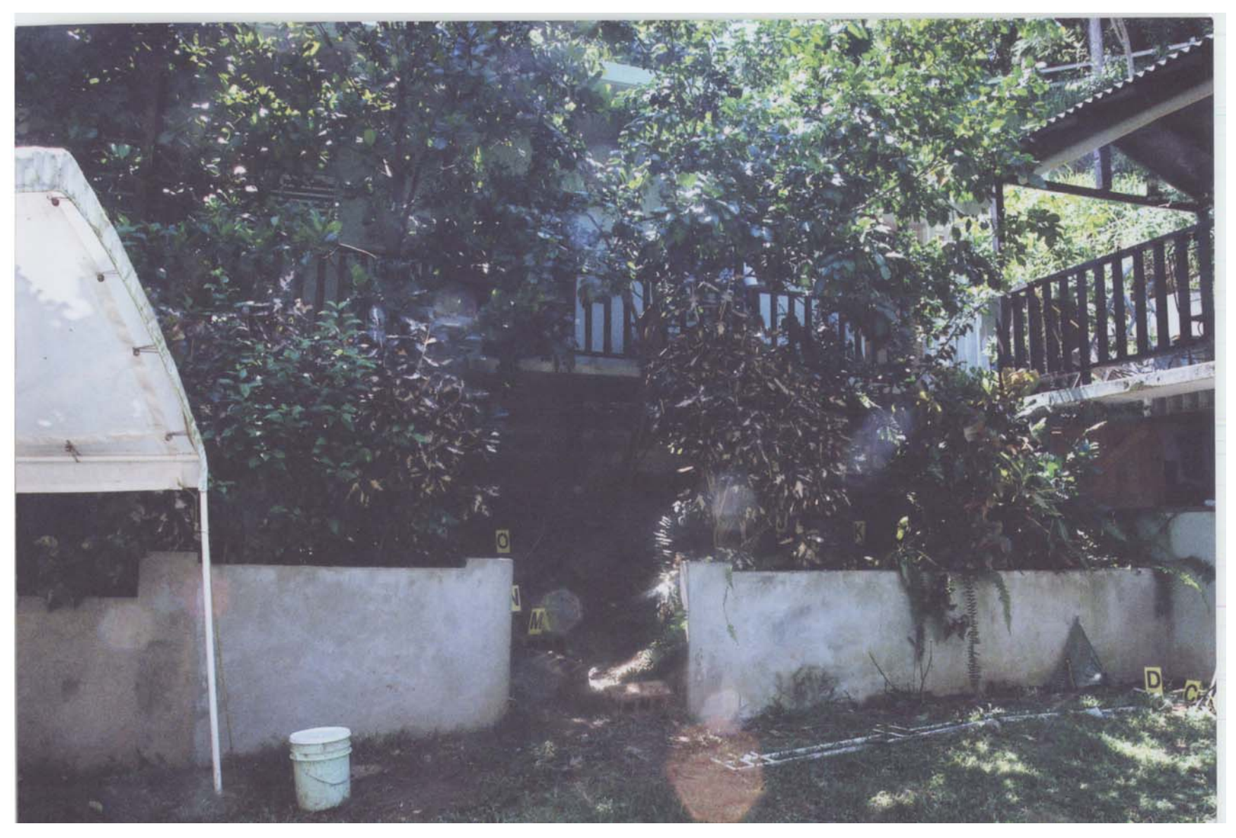
FIGURE A View of the Front of the Residence (Before Foliage Removed)