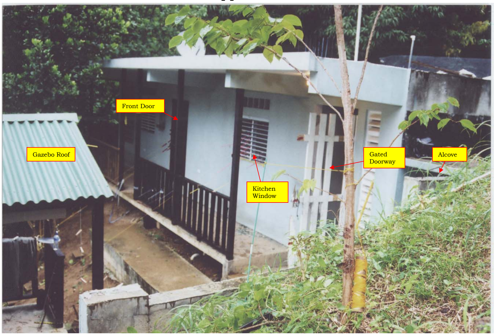
FIGURE D View of Residence from Approximate Position of Shooter