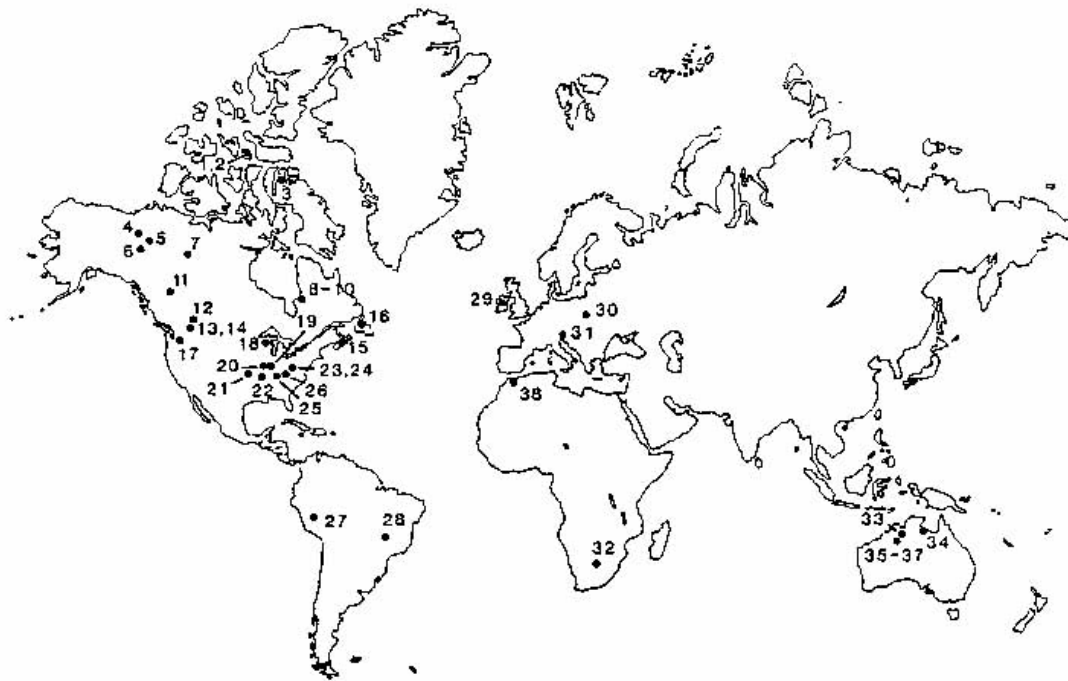
Figure 1. Distribution of carbonate-hosted Zn-Pb deposits occurring throughout the world. Figure from Leach and others (1995). Locations shown: 1, Polaris; 2, Eclipse; 3, Nanisivik; 4, Gayna; 5, Bear-Twit; 6, Godlin; 7, Pine Point district; 8, Lake Monte; 9, Nancy Island; 10, Ruby Lake; 11, Robb Lake; 12, Monarch-Kicking Horse; 13, Giant; 14, Silver Basin; 15, Gays River; 16, Daniels Harbour; 17, Metaline district; 18, Upper Mississippi Valley district; 19, southeast Missouri district (Old Lead Belt, Viburnum Trend, Indian Creek); 20, central Missouri district; 21, tri-State district; 22, northern Arkansas district; 23, Austinville-Ivanhoe district; 24, Friedensville; 25, central Tennessee district; 26, east Tennessee district; 27, San Vicente; 28, Vazante; 29, Harberton Bridge; 30, Silesian district; 31, Alpine district; 32, Pering; 33, Sorby Hills; 34, Coxco; 35-37, Lennard Shelf district (Cadjebut, Blendvale, Twelve Minle Bore); 38, El-Abad-Mekta district. (Adapted from Sangster, 1990).