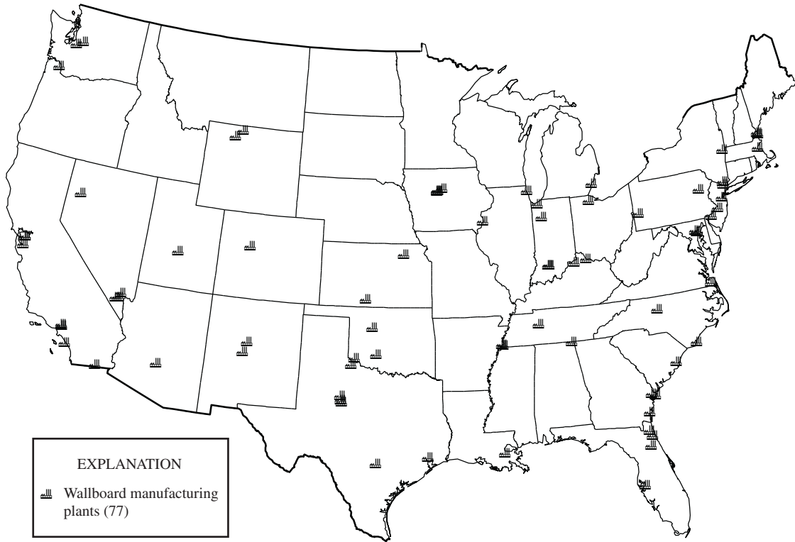
FIGURE 2 WALLBOARD MANUFACTURING PLANTS IN THE UNITED STATES IN 2004