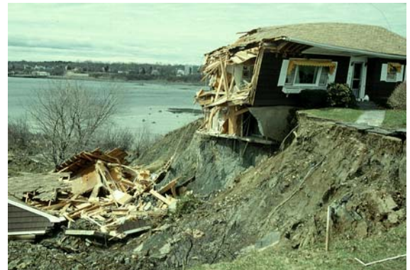
A large landslide in marine mud in Rockland in 1996 destroyed two homes.