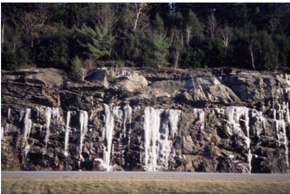
Ice formed on a road cut graphically illustrates the role of fractures in determining groundwater quantity. In this example, most of the water flows through one near-horizontal fracture.

Geologic maps form the foundation of site investigations of many types ranging from aggregate resource assessments to ecological analysis. Some specific uses of geologic maps are the following: