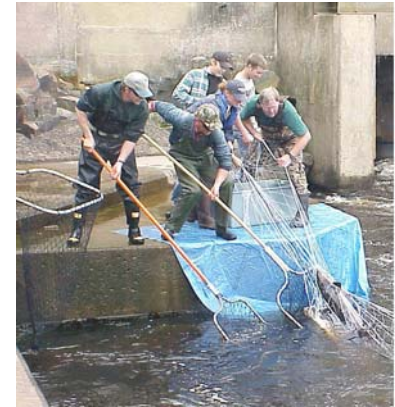
La Crosse FRO volunteers retrieve gill net from Chippewa River as WI DNR staff use dip nets to capture lake sturgeon for tagging

If you are interested in temporary employment which supports the protection and conservation of fish and their habitats, perhaps the STEP and SCEP programs are for you.