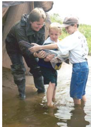
Young volunteers from La Crosse FRO experience a Chippewa River paddlefish for the first time.