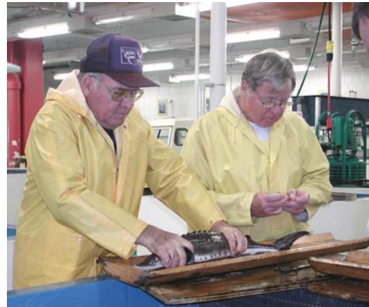
La Crosse FRO volunteers tag lake sturgeon that will be stocked at the Menominee Indian Reservation