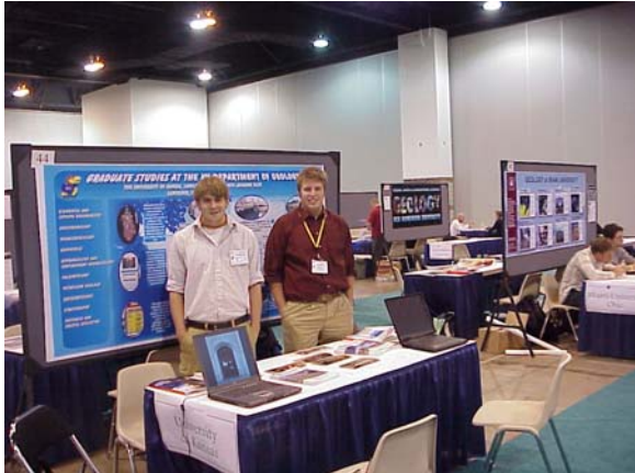
One of the most interesting things about GSA conferences is their enormous university presence, including dozens of booths representing university geology departments. Above, two graduate students hosting the University of Kansas exhibit. Rock Chalk Jayhawk!