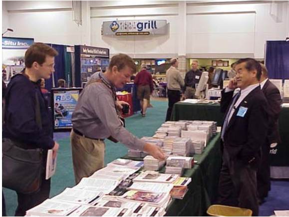
Above, USGS geologists and scientists in our minerals program displayed and distributed an amazing array of world energy assessment and other CD-ROMs.