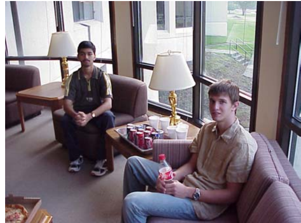
The planners of the week built in some time when I could meet with the students outside the computer lab, as above.