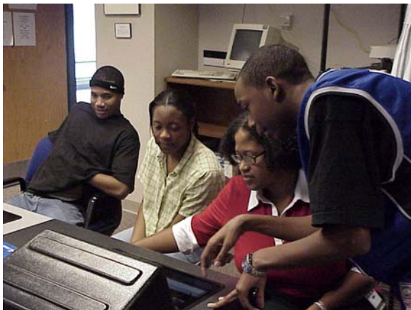
As shown above, students dove right into GIS, and showed excellent peer mentoring skills.