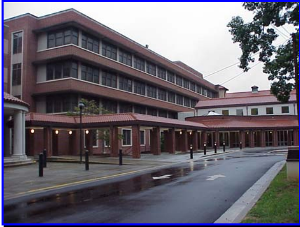
Above, building where the workshops were conducted for a variety of research and science classes in the school—chemistry, Latin America, and Africa.

I conducted evening workshops, and workshops for the chemistry, Latin America, and African studies classes. I was very impressed by the students at NCSSM. The first student I met was analyzing carbon sequestration by plants, and how greenhouse gases were influencing them. Many of these students were conducting research that many college students are not even doing!