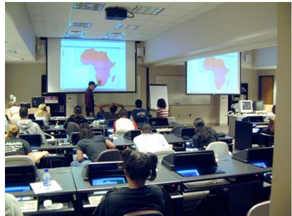
Students analyzing regions, population, and natural hazards with GIS, above and below.