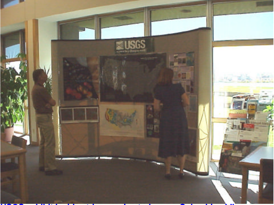
USGS exhibit inside atrium, main study area, Columbine Library.