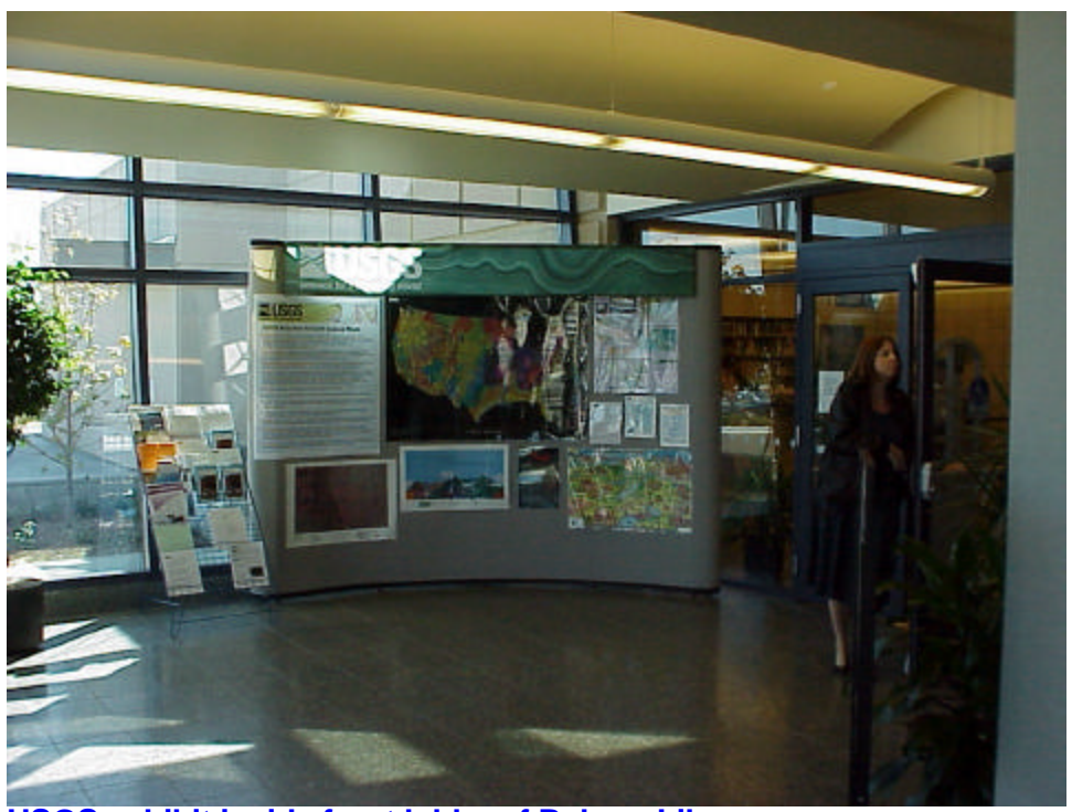
USGS exhibit inside front lobby of Belmar Library.