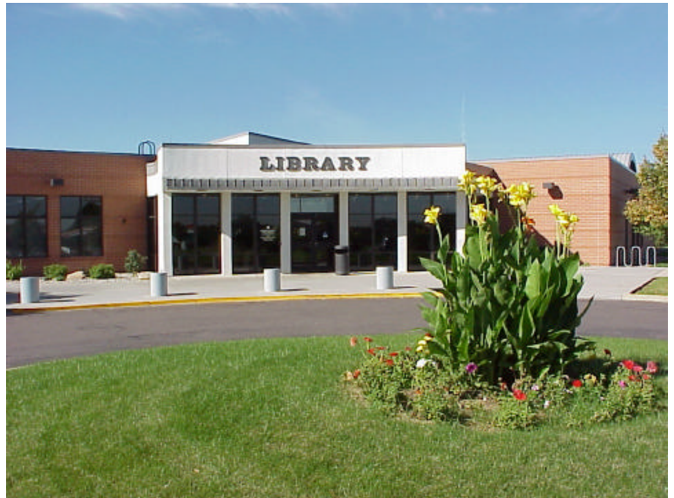
Columbine Library, Littleton.