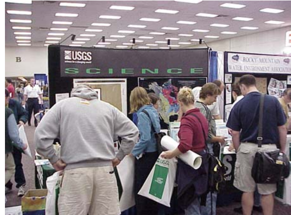
The USGS exhibit was crowded during much of the time, especially during breaks between workshops. This year, we remained open on the first day of the conference until the banquet began, but the attendance was best on the second (main) day of the conference.