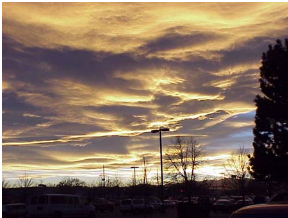
Altostratus lenticularis clouds and sunset greeted us as we packed up the exhibit after the conference.