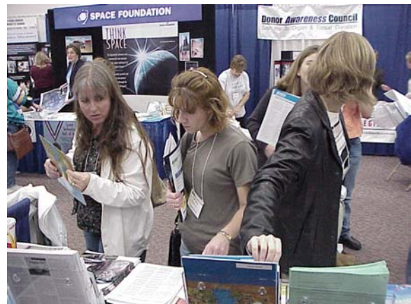
Exhibit customers included K12 educators, university professors, university researchers, private companies, and those who provide teacher training and support. We distributed a flyer for the upcoming GIS in education workshop that we are conducting on 7 December 2002 at ESRI's Denver office and supporting documents on the use of GIS in the curriculum.